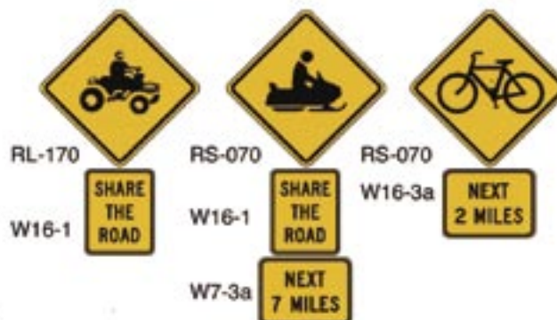
Figure 3A-2— Supplemental plaques for concurrent use.

A supplemental plaque stating XX MILES may also be used in these situations in lieu of or in conjunction with the SHARE THE ROAD supplemental plaque. These combinations may result in the need for taller posts in order to accommodate the signs.