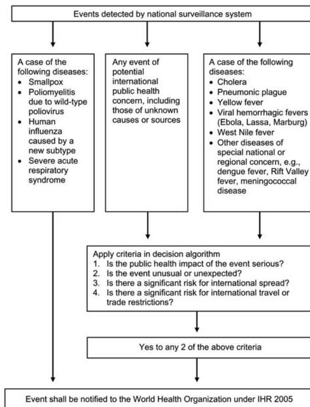
Figure 1. International Health Regulations (IHR) 2005 decision instrument (simplified from annex 2 of IHR).

Second, IHR 2005 contains a “decision instrument” (annex 2) that helps state parties identify whether a health-related event may constitute a PHEIC and therefore requires formal notification to WHO (Figure 1). The decision instrument focuses on risk assessment criteria of public health importance, including the seriousness of the public health impact and the likelihood of international spread.