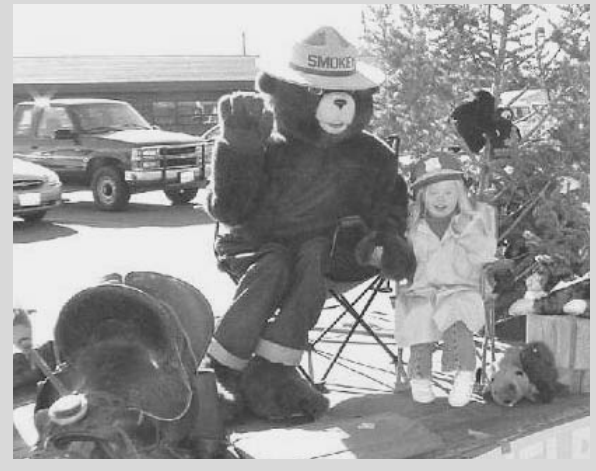
Smokey has an up-close and personal conversation with a friend at the Belgrade Fall Festival.

Partners: Area schools, youth camps, scout and civic organizations, and rural fire departments partnered with the USDA Forest Service to reach a more diverse audience.