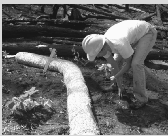
A worker engages in a task to mitigate the risk of fire on the Gallatin National