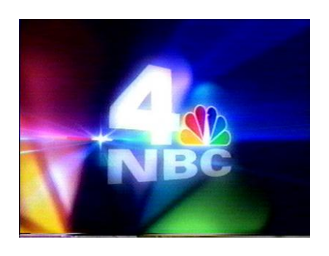
Today in New York 5 a.m. – 6 a.m. August 26, 2008

[CC] 00:04:49 An investigation is underway as to how a Boy Scout god infected with bubonic plague. It's not known where he contracted the disease. The teen was hospitalized but is now recovering at home. Bubonic plague causes fever, headache and exhaustion. 00:07:49