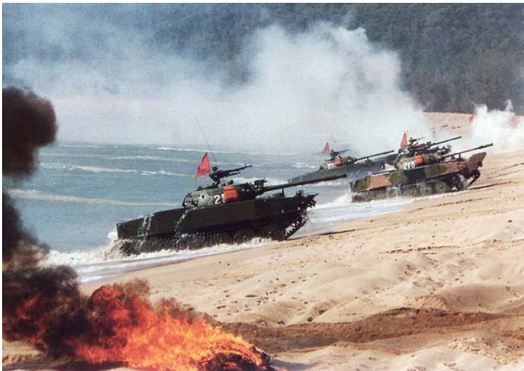
Should coercive measures fail, Beijing might attempt to occupy the entire island of Taiwan. Pictured above is a PLA amphibious training exercise.

Should coercive measures fail, Beijing might attempt to occupy the entire island of Taiwan. Such an operation would require a major commitment of civilian air and maritime transport assets and would not be guaranteed to succeed. The PLA's success in a D-Day style invasion of Taiwan would rest on a number of variables, some tangible – principally the lack of amphibious lift as well as a number of intangibles, including personnel and equipment attrition rates on both sides of the Strait; the interoperability of PLA forces; and the ability of China's logistical system to support a high tempo of operations. In order for an invasion to succeed, Beijing would have to possess the capability to conduct a multi-faceted campaign, involving air assault, airborne insertion, special operations raids, amphibious landings, maritime area denial operations, air superiority operations and conventional missile strikes. The PLA likely would encounter great difficulty conducting such a sophisticated campaign throughout the remainder of the decade. Nevertheless, the campaign likely would succeed – barring third-party intervention – if Beijing were willing to accept the political, economic, diplomatic, and military costs that such a course of action would produce.