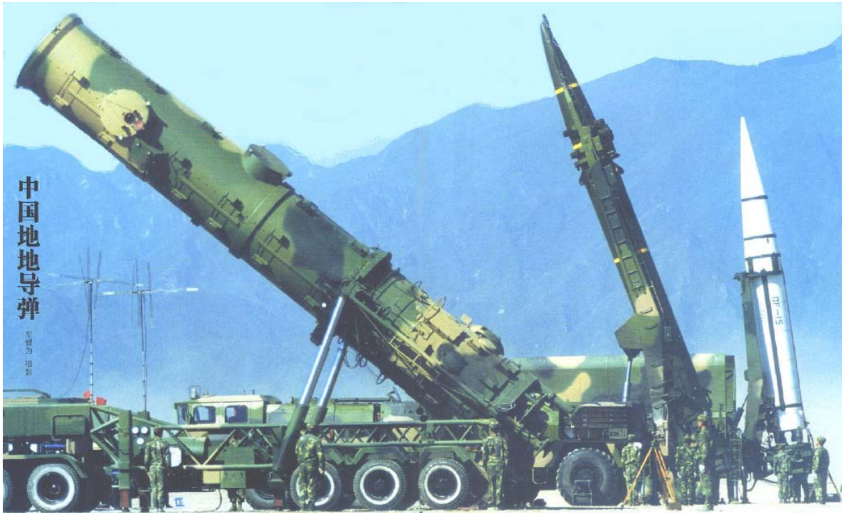
China maintains various types of conventional ballistic missiles.

Beijing's growing conventionally armed missile force provides China with a military capability that avoids the political and practical constraints associated with the use of nuclear-armed missiles. The CSS-6 and CSS-7 SRBMs provide China with a survivable and effective conventional strike force, as will future conventionally armed CSS-5s and LACMs.