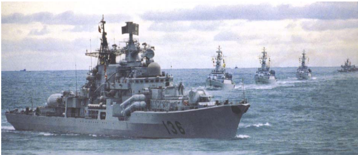
A PLA Navy Russian-built Sovremenny-class destroyer leads a line of warships during exercises last year. China's navy now has two Russian Sovremenny-class destroyers that fire a supersonic anti-ship missile that cannot be shot down by any Asian navy.

The PLAN seeks to push its maritime defense perimeter further seaward. This change in operations will require newer, more modern warships and submarines capable of operating out to the Ryukyu Islands and into the South China Sea. At these extended ranges, the platforms will have to be better armed to enable defense from all methods of attack. The Navy has been conducting research and acquiring foreign technology in an effort to improve the broad range of naval warfare capabilities; it also is acquiring new classes of ships that will be better suited for operations out to the limits of the East and South China Seas.