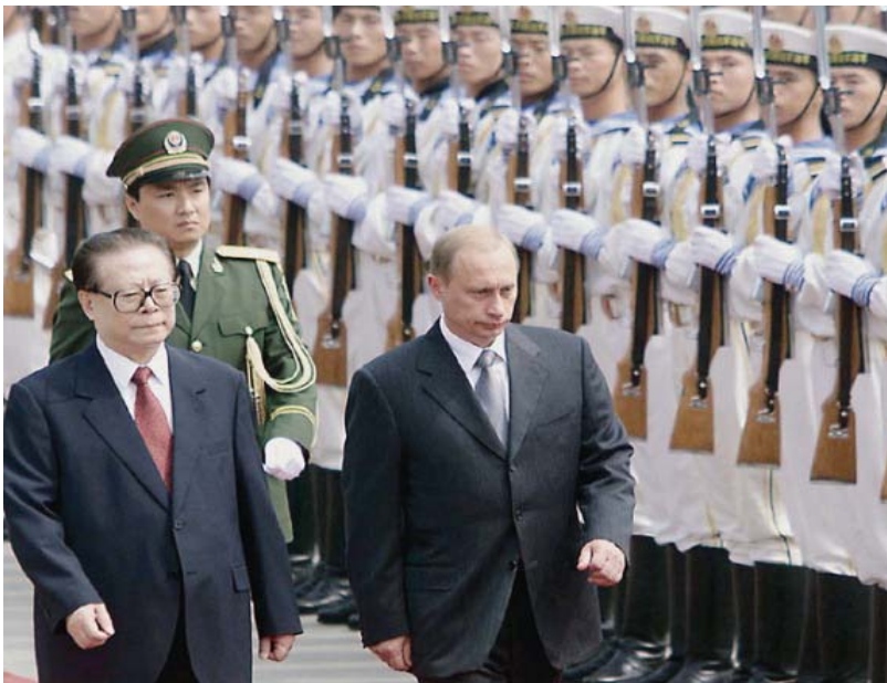
Chinese President Jiang Zemin and Russian President Vladimir Putin.

China's force modernization program is heavily reliant upon assistance from Russia and other states of the former Soviet Union (FSU). China hopes to fill short-term gaps in capabilities by significantly expanding its procurement of Russian weapon systems and technical assistance over the next several years. Beijing's purchase of Russian weapon systems includes advanced fighters, such as the Su-30MKK, modern air defense systems such as the SA-10/20 and SA-15 SAMs, KILo-class submarines, and SOVREMENNY-class destroyers. Sales of these systems are, or likely will be, accompanied by the transfer of precision guided air-to-surface munitions, active, BVR air-to-air missiles, and sophisticated anti-ship cruise missiles. Russia's assistance to China's space program is extensive. Russian arms sales and technical assistance to China accelerate Beijing's force modernization, and likely will have a significant impact on its ability to use military force.