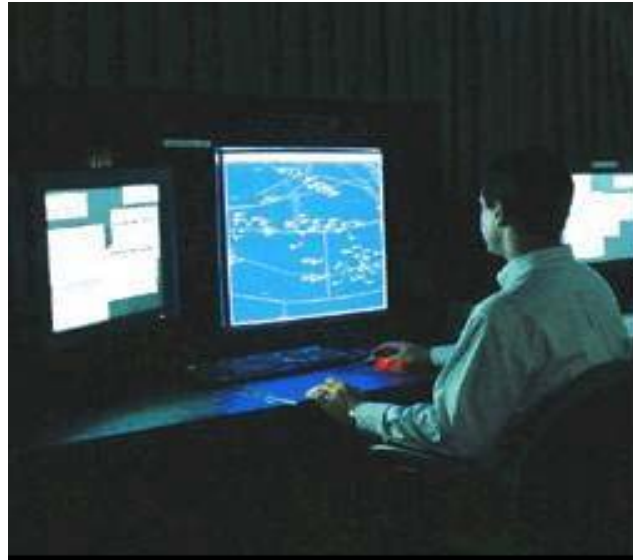
Figure 7. Oceanic Automation System

Transoceanic travel is growing faster than domestic travel, and the increasing tempo of operations is resulting in operational inefficiencies.