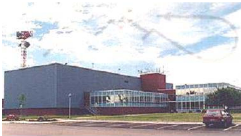
Figure 4. En Route Center

Most of the 21 Air Route Traffic Control Centers (ARTCC) and the Combined Center Radar Approach Control (CERAP) facility at San Juan, Puerto Rico, were built in the early 1960s and over the years have been expanded and modernized in phases. However, much of the