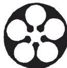
(22) TENRIKYO CHURCH