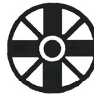
(24) THE CHURCH OF WORLD MESSIANITY (IZUNOME)