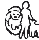
(20) COMMUNITY OF CHRIST