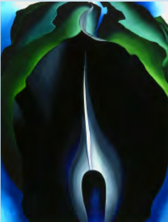
Jack-in-the-Pulpit No. iv