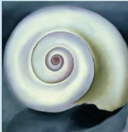
top: Georgia O'Keeffe, The Shell , 1934, National Gallery of Art, Washington, From the Collection of Dorothy Braude Edinburg