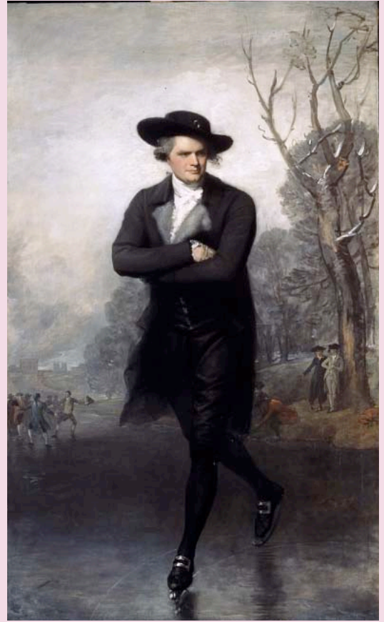
Gilbert Stuart, The Skater (William Grant), 1782, oil on canvas, National Gallery of Art, Washington, Andrew W. Mellon Collection