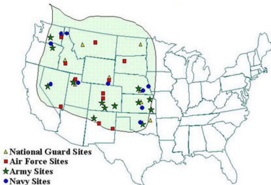
Figure 1. Adapted area for SERDP-select germplasms. All plant materials were collected within this area.

While our current emphasis is on improving the resilience of native species present on training lands, the research program began by looking primarily at introduced or naturalized species. Our first three releases are naturalized species; in-progress program reviewers were concerned about the effects of introducing these cultivars in native ecosystems. To address this concern, we invited a panel of independent reviewers from the U.S. Environmental Protection Agency, The Nature Conservancy, USDA-NRCS, and another USDA-ARS office to review the materials we were developing at Yakima Training Center (Palazzo et al. 1999). This group met in May 1999 and evaluated a research site of mature plants, examined several previously sown sites of naturalized grasses, and reviewed our data. The naturalized species we are working with are limited to bunch-type or moderately rhizomatous species that are already present on military training lands, and the review panel found that the plants were not encroaching into other plant communities and were not establishing monocultures.