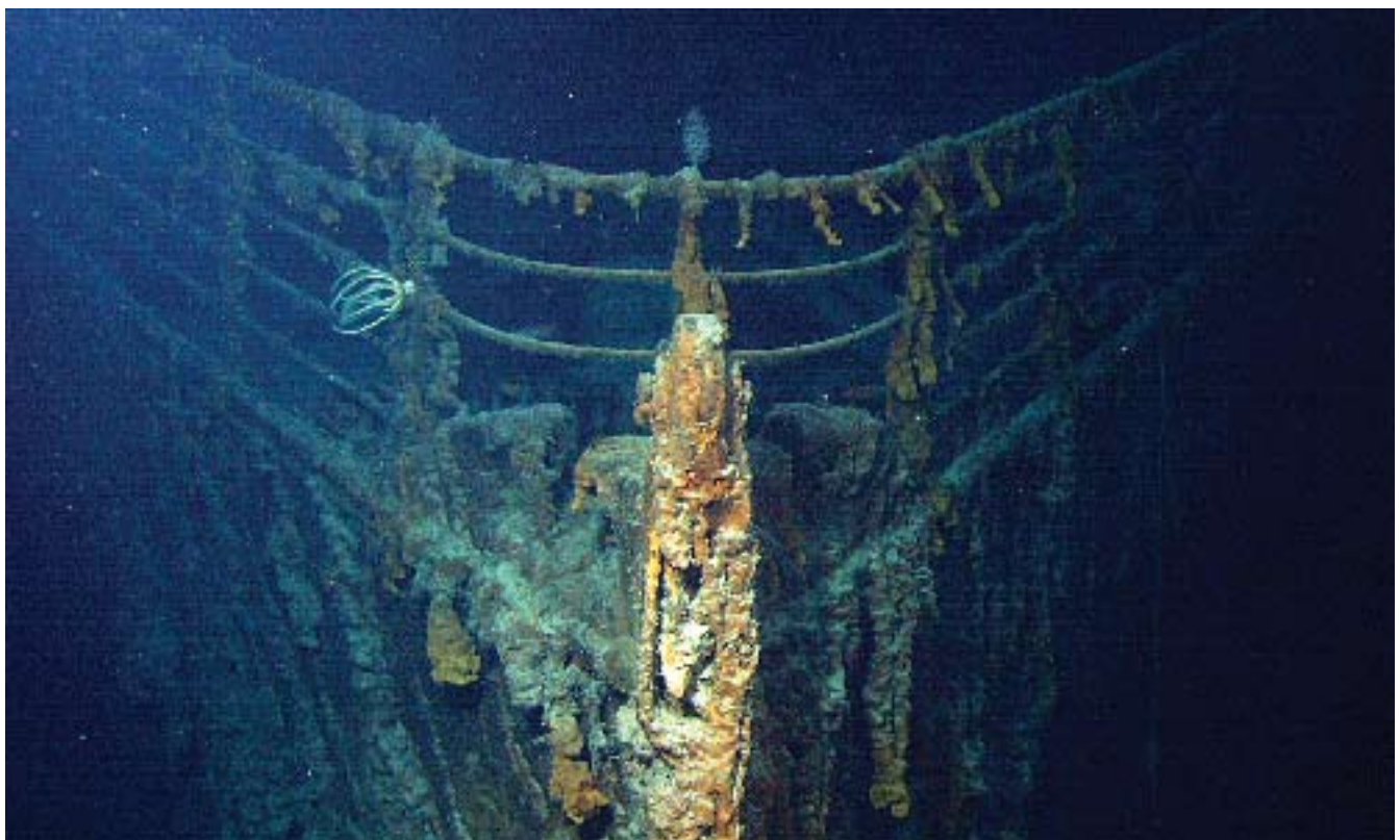
Figure 1: A close-up of the Titanic's bow

The wreckage of Titanic was discovered on September 1, 1985, during a joint French/U.S. expedition lead by Jean-Luis Michel of the French Ocean Institute (IFREMIR) and Dr. Robert Ballard. It was found approximately 340 nautical miles (nm) off the coast of Newfoundland, Canada two miles beneath the high seas (depth of 12 500 feet or 3,800 meters). The expedition discovered that the stern section was some 1,970 feet (600m) from the bow section and did not sink to the bottom intact as was previously believed. Shortly after the discovery, Dr. Ballard appeared before the US Congress seeking to protect the wreck. Congress responded through the enactment of legislation directing the Department of State to negotiate an international agreement to designate the wreck as a maritime memorial. A U.S. company working with IFREMIR returned to the wreck in 1987 and began to salvage artifacts from the debris field.