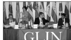
GLIN directors, representing twenty member countries, met at the Library in 2006 for their annual meeting

The Global Legal Information Network (GLIN) database, designed to share the laws of member nations in the vernacular, goes online.