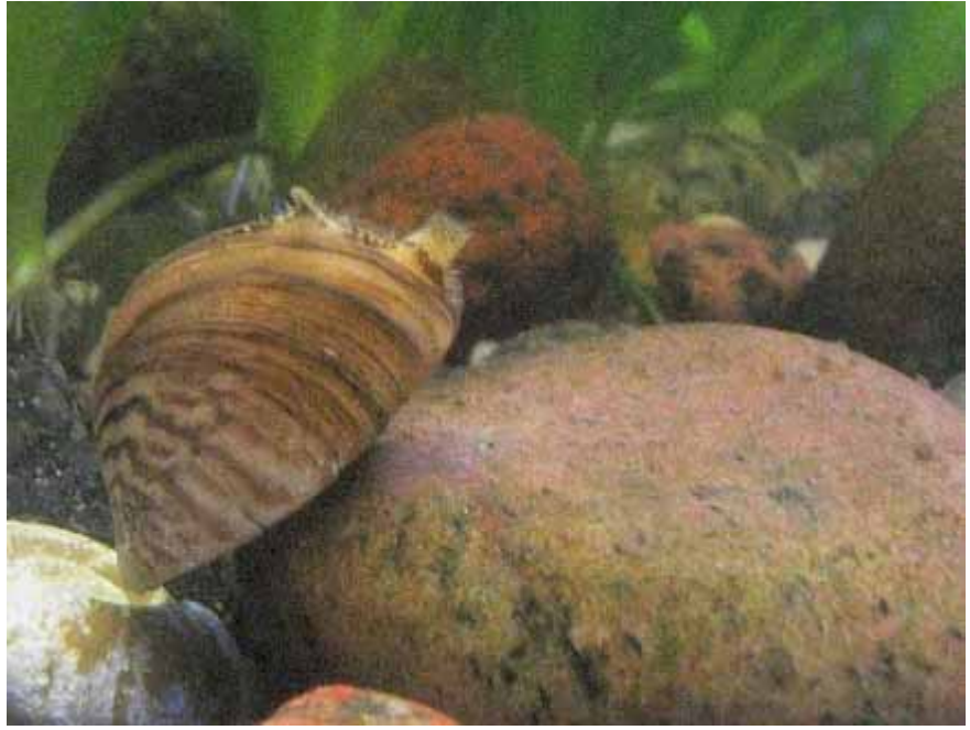
Fig. 1. Dreissena polymorpha.

Synonyms: Mytilus polymorphus (Pallas), Mytilus hagenii, Tichogonia chemnitzii (Rossm.) Common names: Zebra mussel, Wandering mussel (GB), Zebramuschel, Wandermuschel, Dreikantmuschel, Dreiecksmuschel, Schafklaumuschel (DE), Vandremusling (DK), Tavaline ehk muutlik rändkarp (EE), Vaeltajasimpukka (FI), Svītrainā gliemene (LV), Dreisena (LT), Racicznica zmienna (PL), Vandringsmussla (SE).