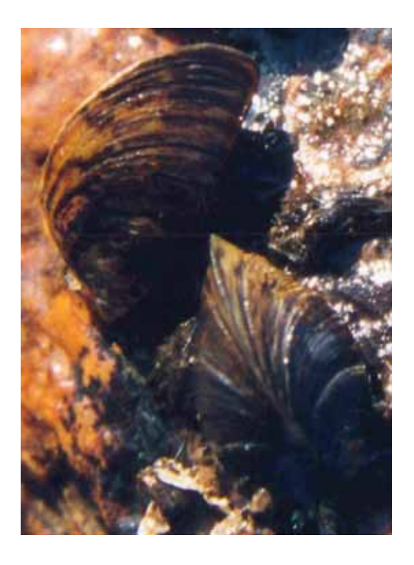
Fig. 2. Dreissena polymorpha , photo by Jonne Kotta, source: <u>D. polymorpha fact-sheet</u>, produced by Estonian Marine Institute.