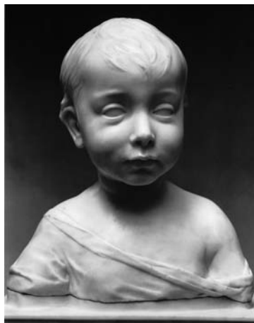
Desiderio da Settignano