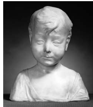
Desiderio da Settignano Florentine, 1428/1430–1464