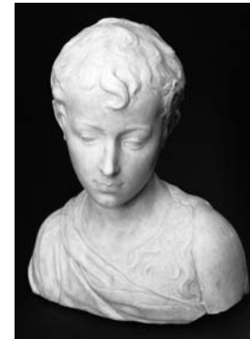
Antonio Rossellino Florentine, 1427–1479

Marble, 30.5 x 26.5 x 16.3 cm (12 x 10 \frac{3}{8} x 6 \frac{3}{8} in.) Samuel H. Kress Collection 1943.4.94