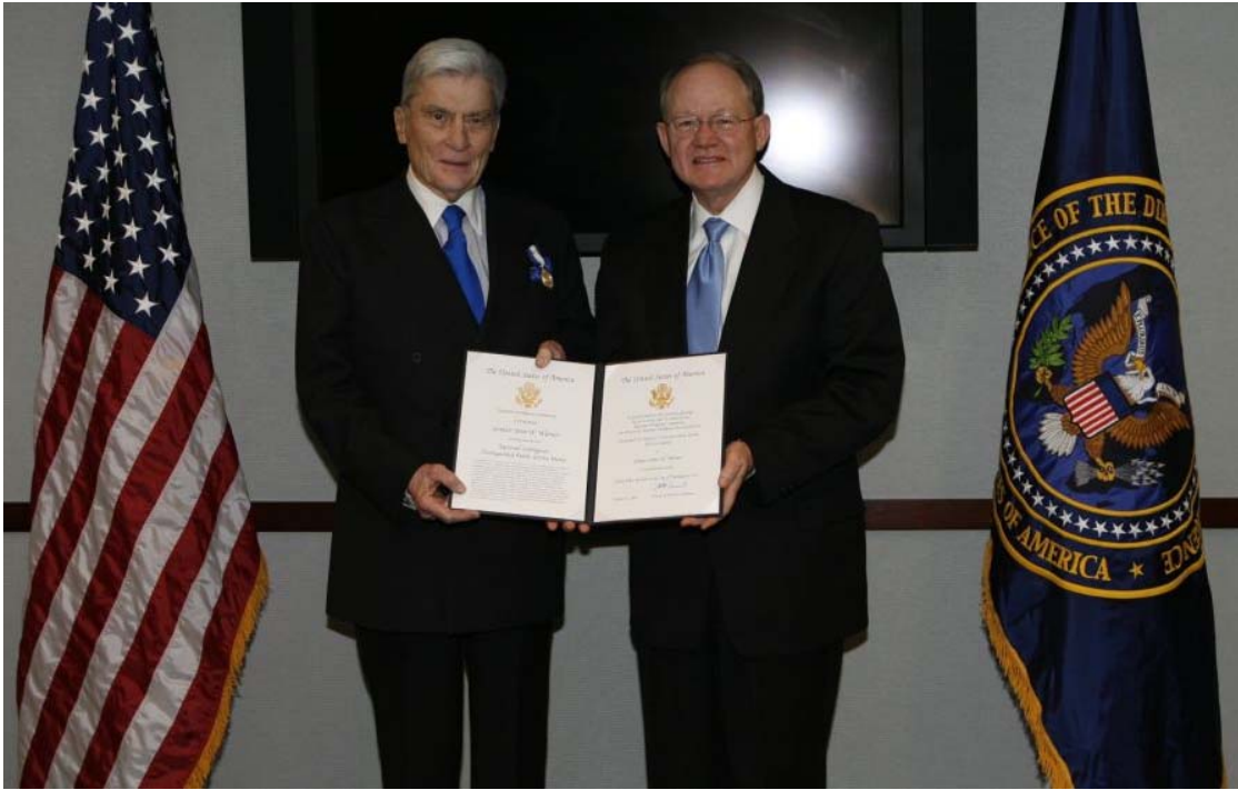
Director of National Intelligence, Mike McConnell (R), present Senator John Warner with the National Intelligence Distinguished Public Service Medal