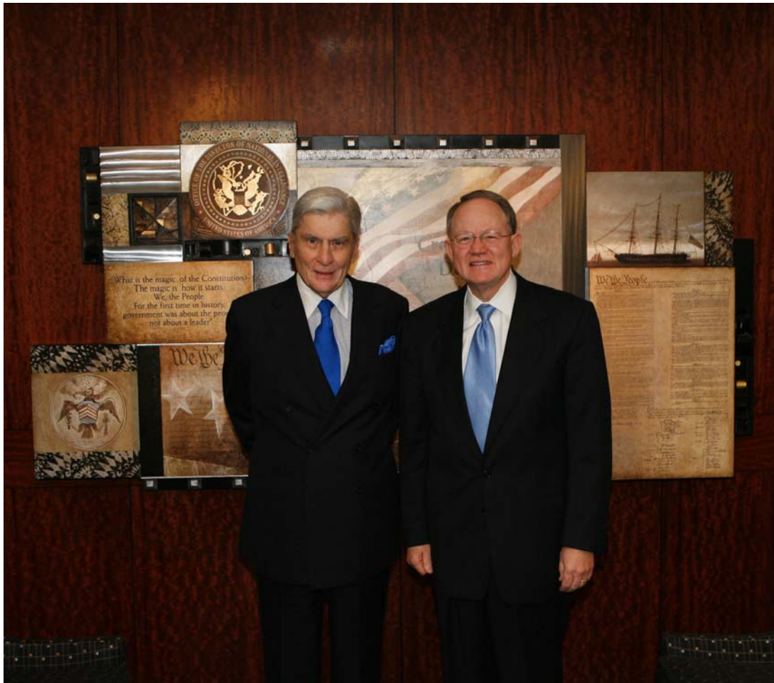
Director of National Intelligence, Mike McConnell (R), with Senator John Warner after presenting the National Intelligence Distinguished Public Service Medal