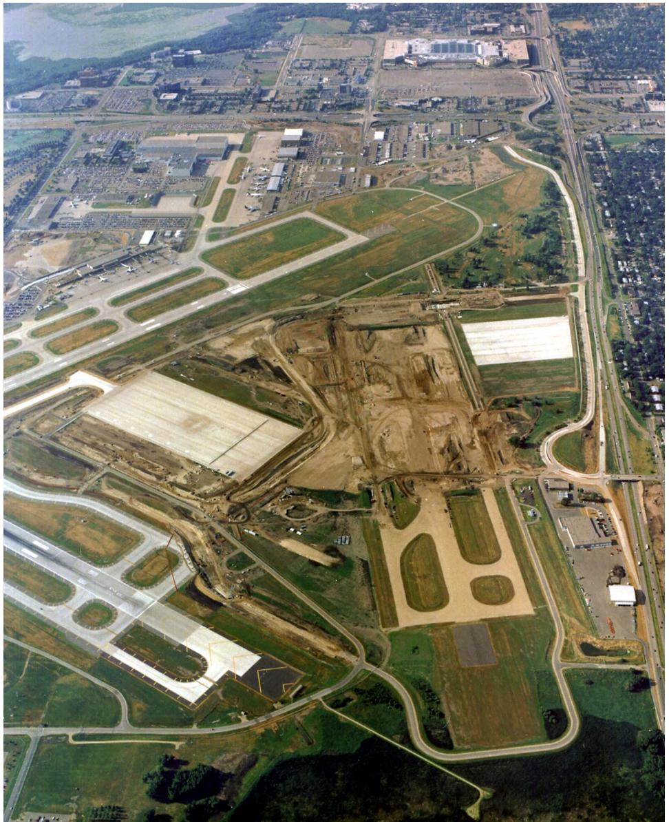
Figure 3: Increasing Airport Capacity through Runway Development