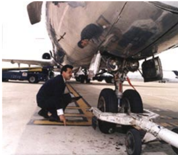
Figure 7: FAA Safety Inspection in Progress

Improving the effectiveness of FAA's inspections of airline operations is key to improving aviation safety. The FAA Administrator has noted that perhaps the greatest support the agency can provide to the industry is a robust safety oversight role that will not waver in difficult times. FAA's new inspection program, the Air Transportation Oversight System, is central to this oversight role. This program, which was implemented in 1998, aims to ensure not only that airlines comply with FAA's safety requirements but also that they have operating systems to control risks and prevent accidents. Figure 7 shows an FAA inspector inspecting an aircraft for compliance with FAA's safety requirements.