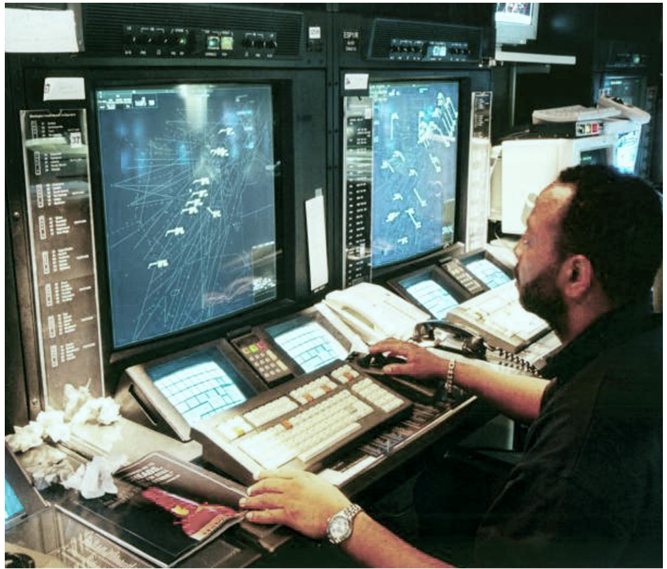
Figure 5: Air Traffic Controller