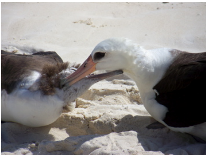
An Albatross preens its young. Lisianski Island is an important nesting area for the Albatross as well as other seabirds.

arrested feather poachers and confiscated and destroyed about 1.4 tons of feathers, representing 140,400 birds. Today, Hawaiian monk seals and green sea turtles are common visitors to Lisianski's sandy white beaches. Migratory shorebirds seen on the island include the kolea (golden plover), ulili (wandering tattler), and kioea (bristle-thighed curlew). Nearly three-fourths of the Bonin petrels nesting in Hawai`i make this island their home. In some years, more than a million sooty terns visit Lisianski.