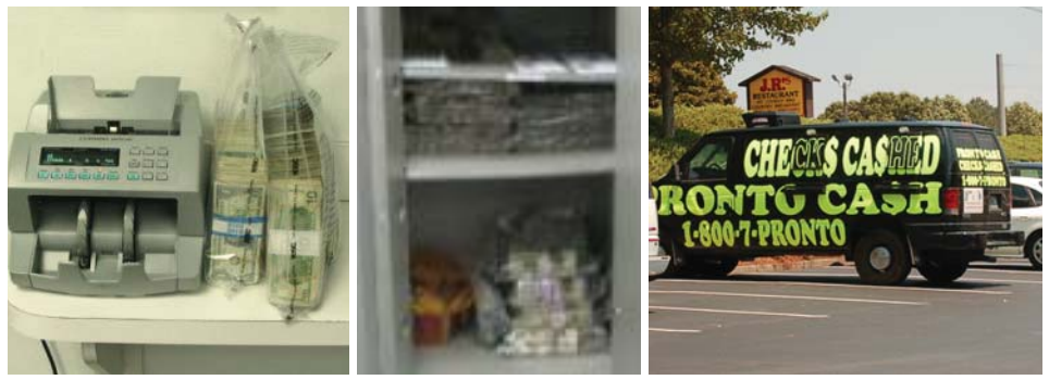
Cash and evidence seized during an investigation into the illegal activities of Pronto Cash, a Florida business, that used mobile check-cashing vans pictured above, indicted for operating an unlicensed money service.

In July 2006, ICE launched Operation Paycheck, a national initiative designed to combat criminal schemes involving the exploitation of the financial industry by businesses to pay the wages of illegal alien workers.