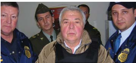
Gilberto Rodriguez-Orejuela shown during his arrest and subsequent extradition to the U.S. where he is currently serving a 30-year prison sentence.

The 15-year investigation under ICE's leadership is a testament to the agents' and prosecutors' tenacity, innovation and good old-fashioned detective work.