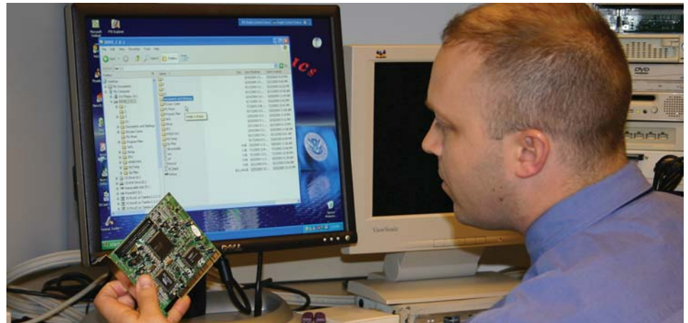
Specially-trained agents at the ICE Cyber Crimes Center investigate Internet-based financial crimes.

Training: To foster the efforts to create a robust and aggressive investigative program, the C3 has provided training to more than 150 ICE field agents in 2006 to specifically focus money laundering investigations on the Internet financial sectors.