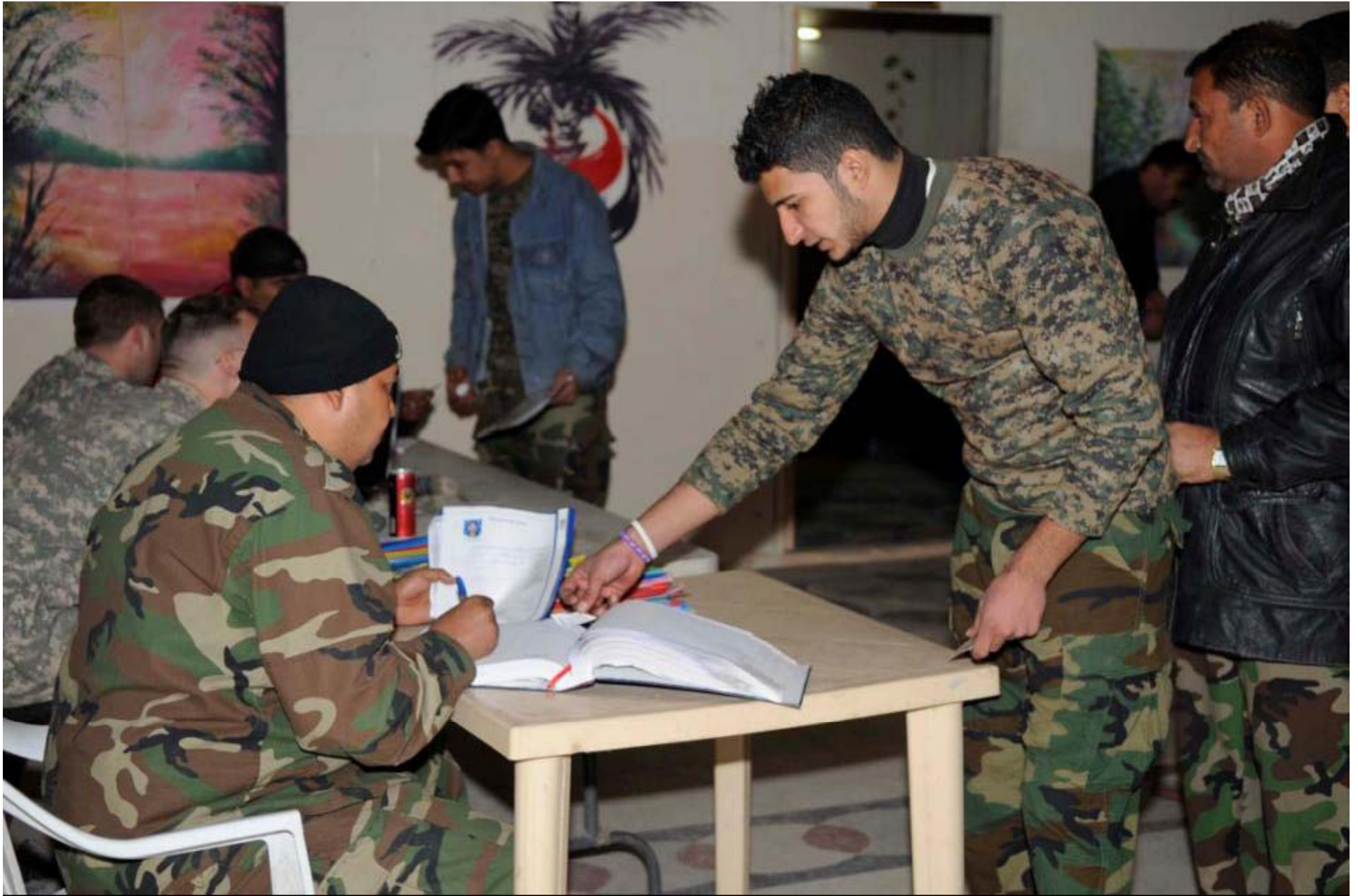
The Sons of Iraqi are set to receive their pay for the second time from the Iraqi government in Baghdad, Iraq, Dec. 22, 2008.

081222-A-1924B-032