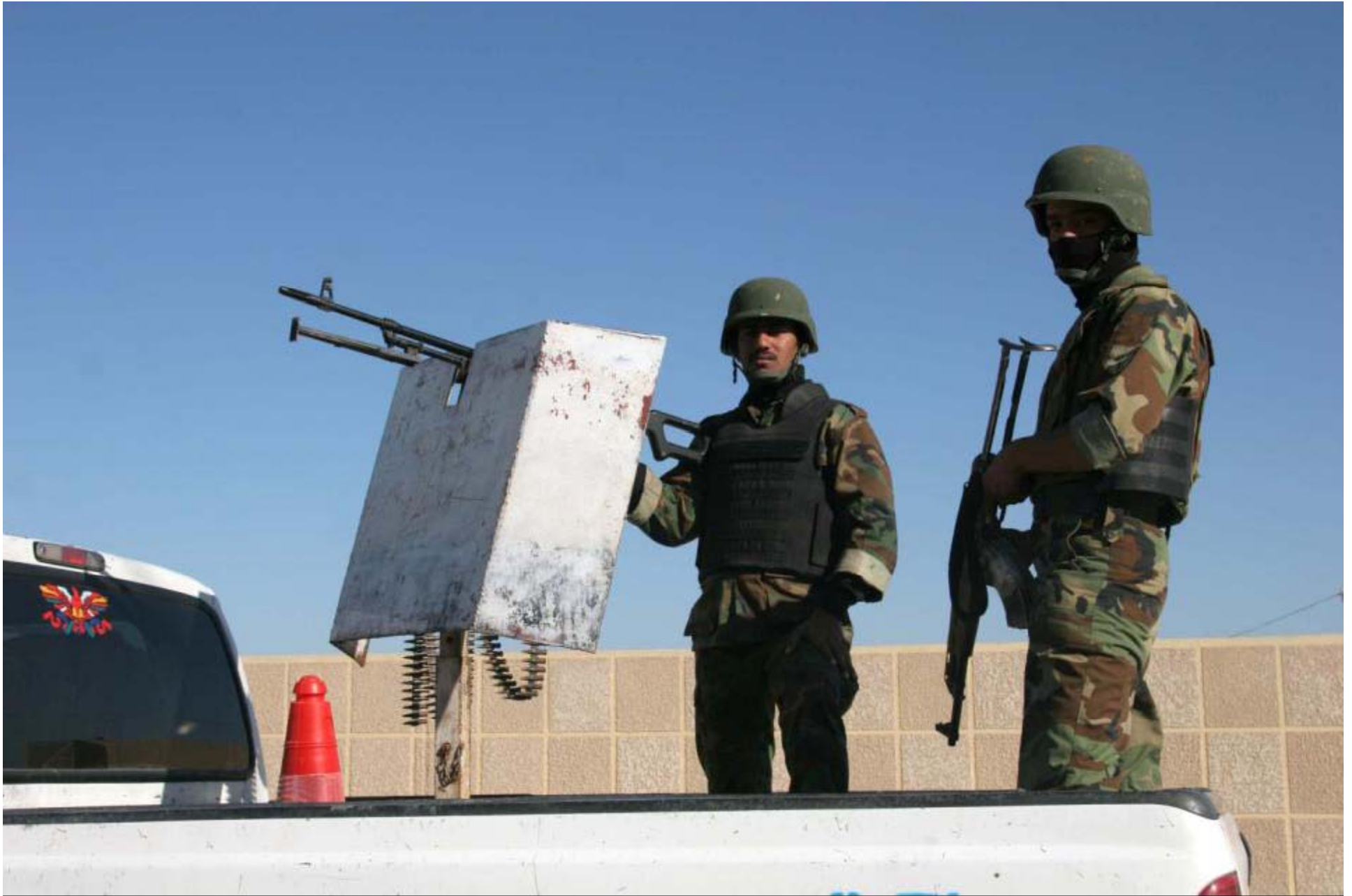
Iraqi Police Officers provide security as U.S. Marines with Company E, 2nd Battalion, 9th Marine Regiment, Regimental Combat Team 1 (RCT-1) participate in a joint patrol with Iraqi Police in Ramadi, Iraq, Dec. 4, 2008. Marines and Iraqi Police patrol to protect people in the area and to provide an opportunity for the Iraqi Police to practice techniques the Marines have taught them. 081204-M-6770H-090