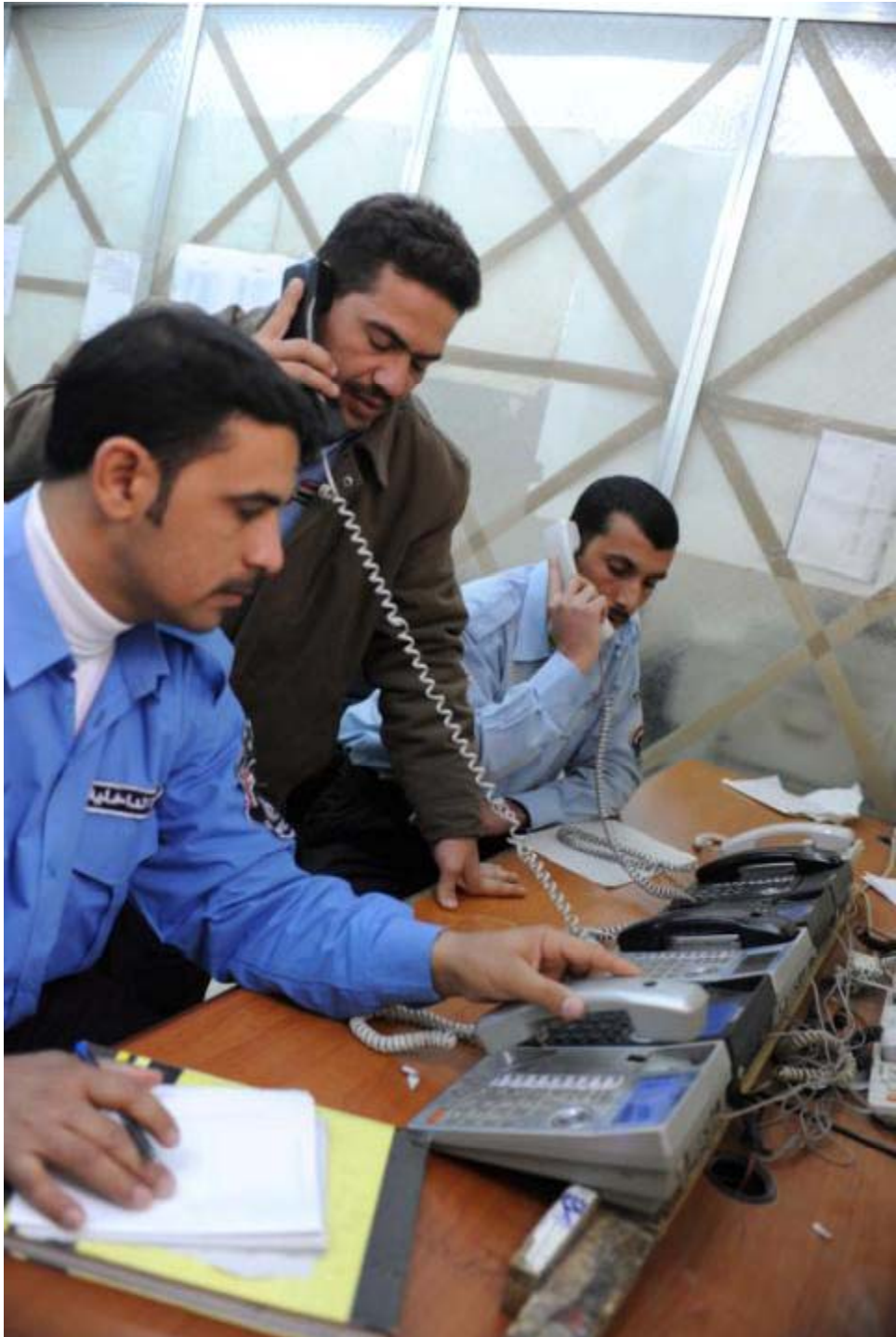
Iraqi Policemen take emergency calls at the Provincial Joint Coordination Center in As Samawah, Iraq, Dec 21, 2008. From here they also dispatch police and first responders to the community as needed.

081221-A-8552S-064