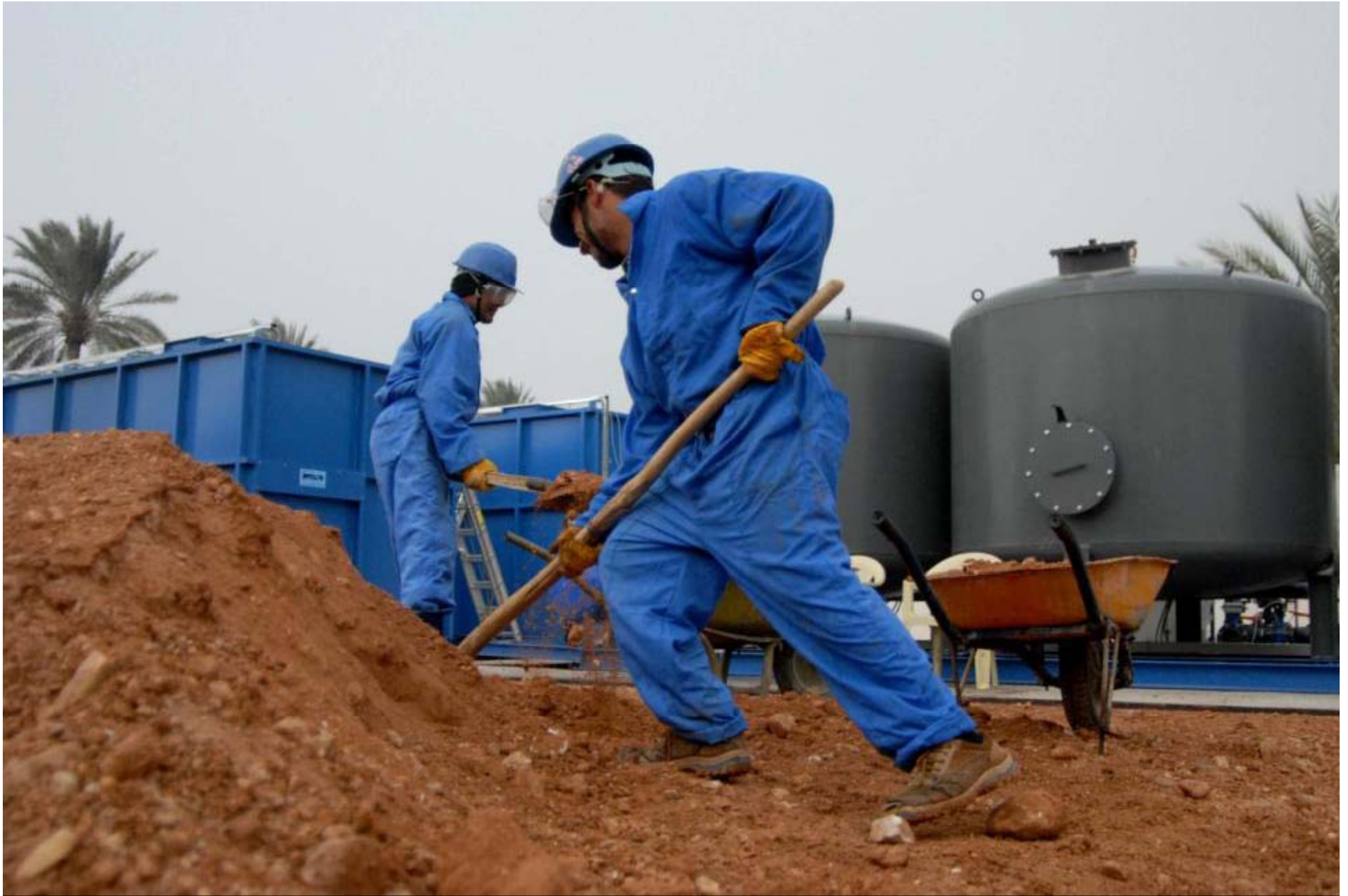
Two Iraqi workers move dirt for use in construction at the Al Rashid water compact unit in Iskandariyah, Iraq, Dec. 23, 2008.

081223-N-4245W-038