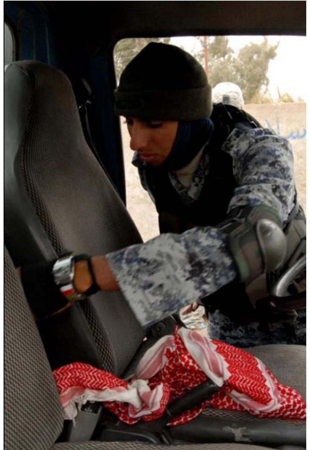
An Iraqi policeman searches the cab of a truck at checkpoint 77 on Alternative Supply Route Jackson outside of Haswah, Iraq, Dec. 22, 2008.

081222-N-4245W-143 UNCLASSIFIED