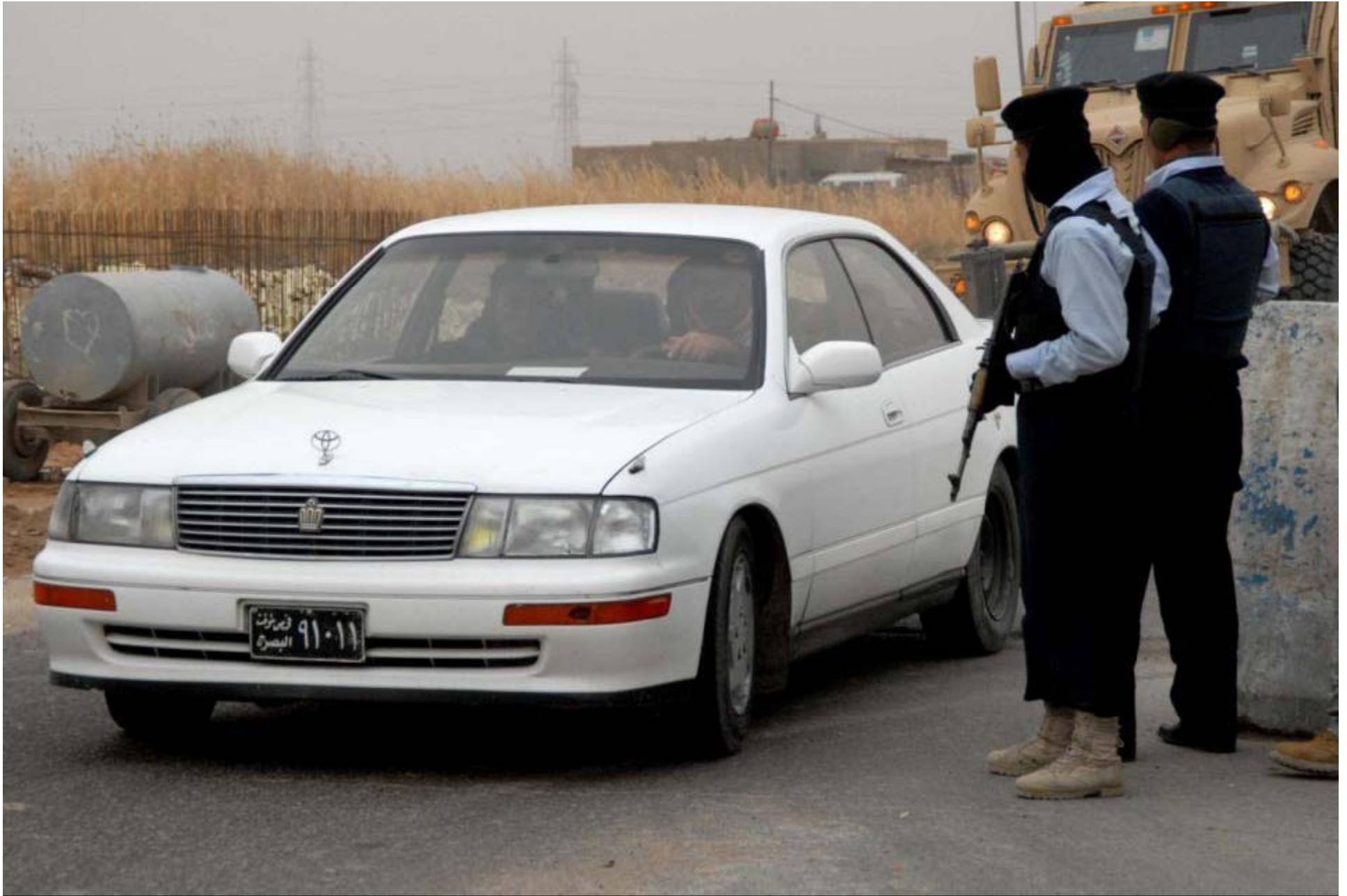
Two Iraqi policemen stand guard at checkpoint 77 on Alternative Supply Route Jackson outside of Haswah, Iraq, Dec. 22, 2008.

081222-N-4245W-129