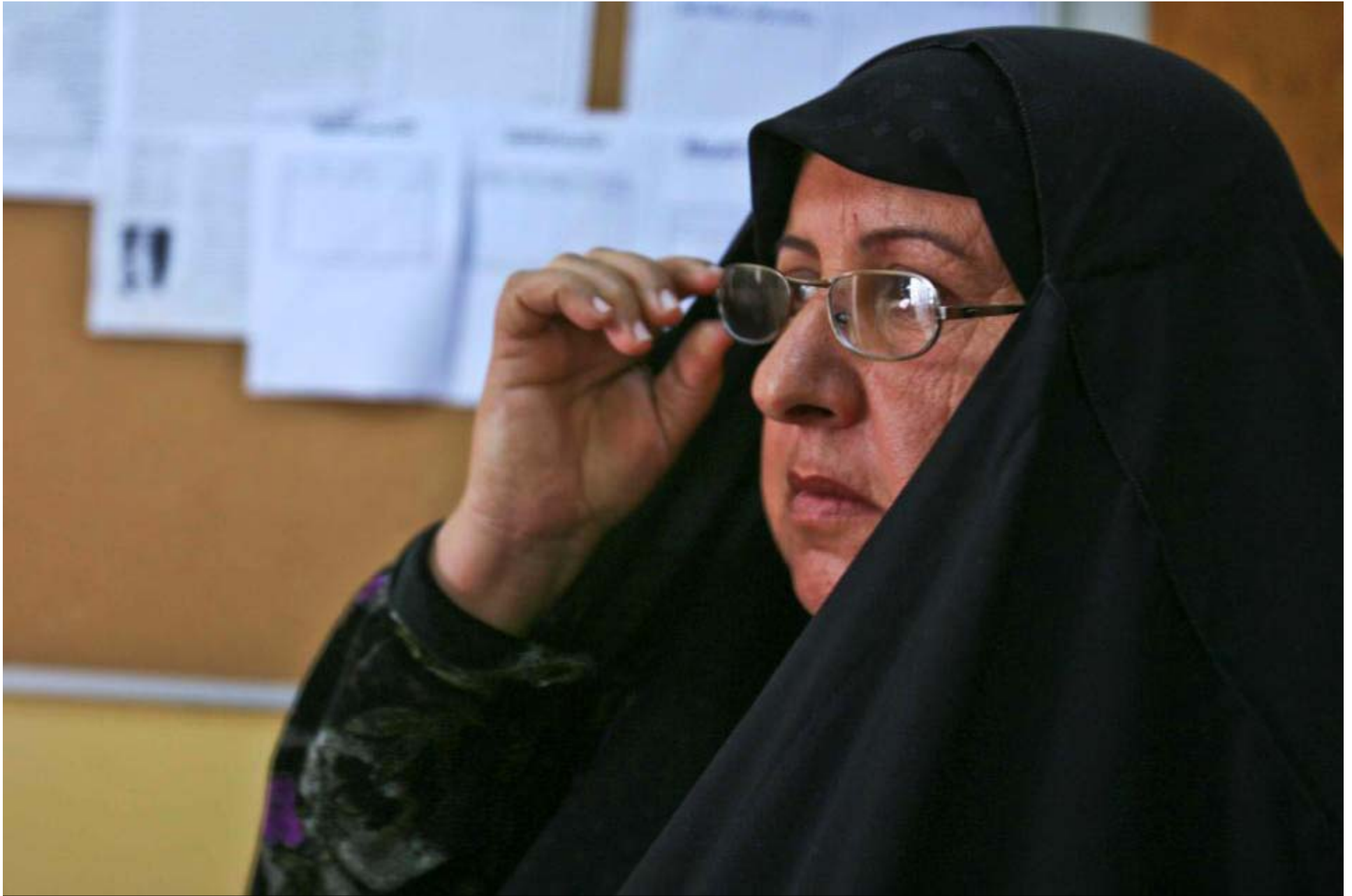
An Iraqi woman tries on a pair of prescription glasses during an Optometry Cooperative Medical Engagement (CME) at Saqlawiyah, Iraq, Nov. 18, 2008. U.S. Marines and Sailors supported the Saqlawiyah Clinic with the first Optometry CME conducted in Iraq and to gather atmospheric information, reinforce the legitimacy of the Iraqi Police and the organic medical services. 081118-M-4937G-044