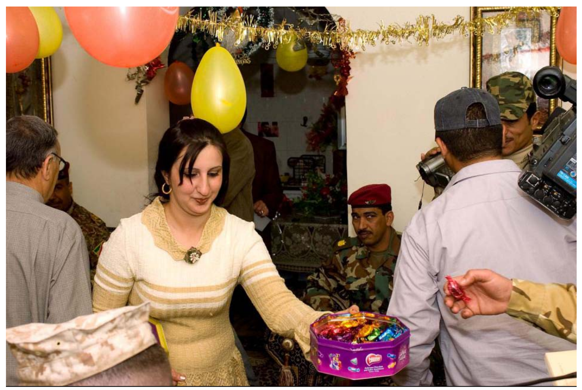
An Iraqi woman distributes sweets to Iraqi Army Soldiers and Iraqi Police Officers during a joint visit to her home on Christmas day, Dec. 25, 2008, Basra, Iraq.