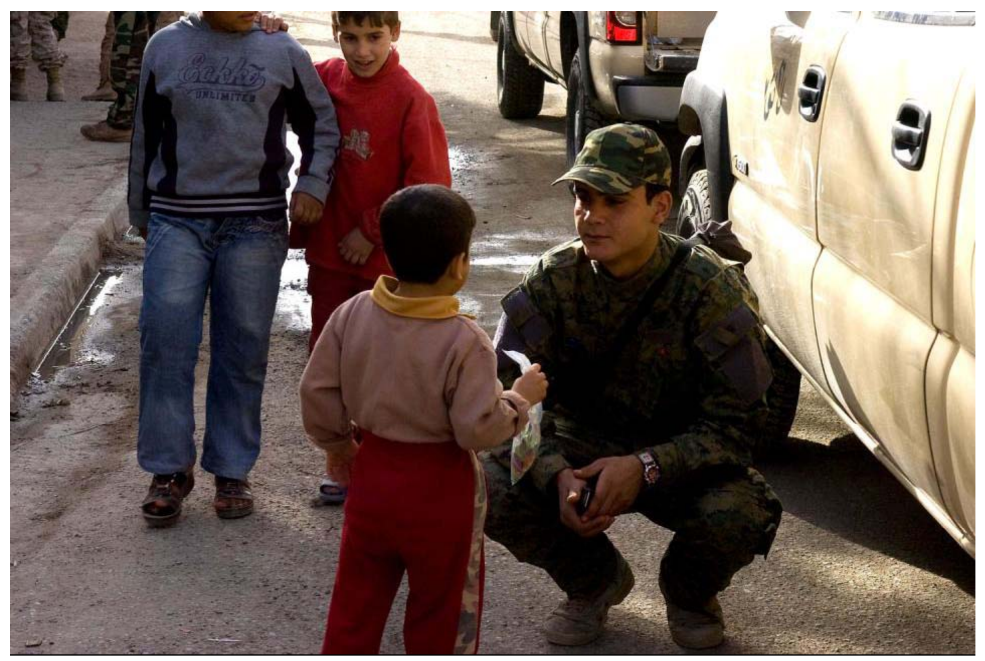
An Iraqi soldier gives sweets to a child during a joint visit with the Iraqi Police to the Al Hayyaniah district on Christmas day, Dec. 25, 2008, in Basra, Iraq.