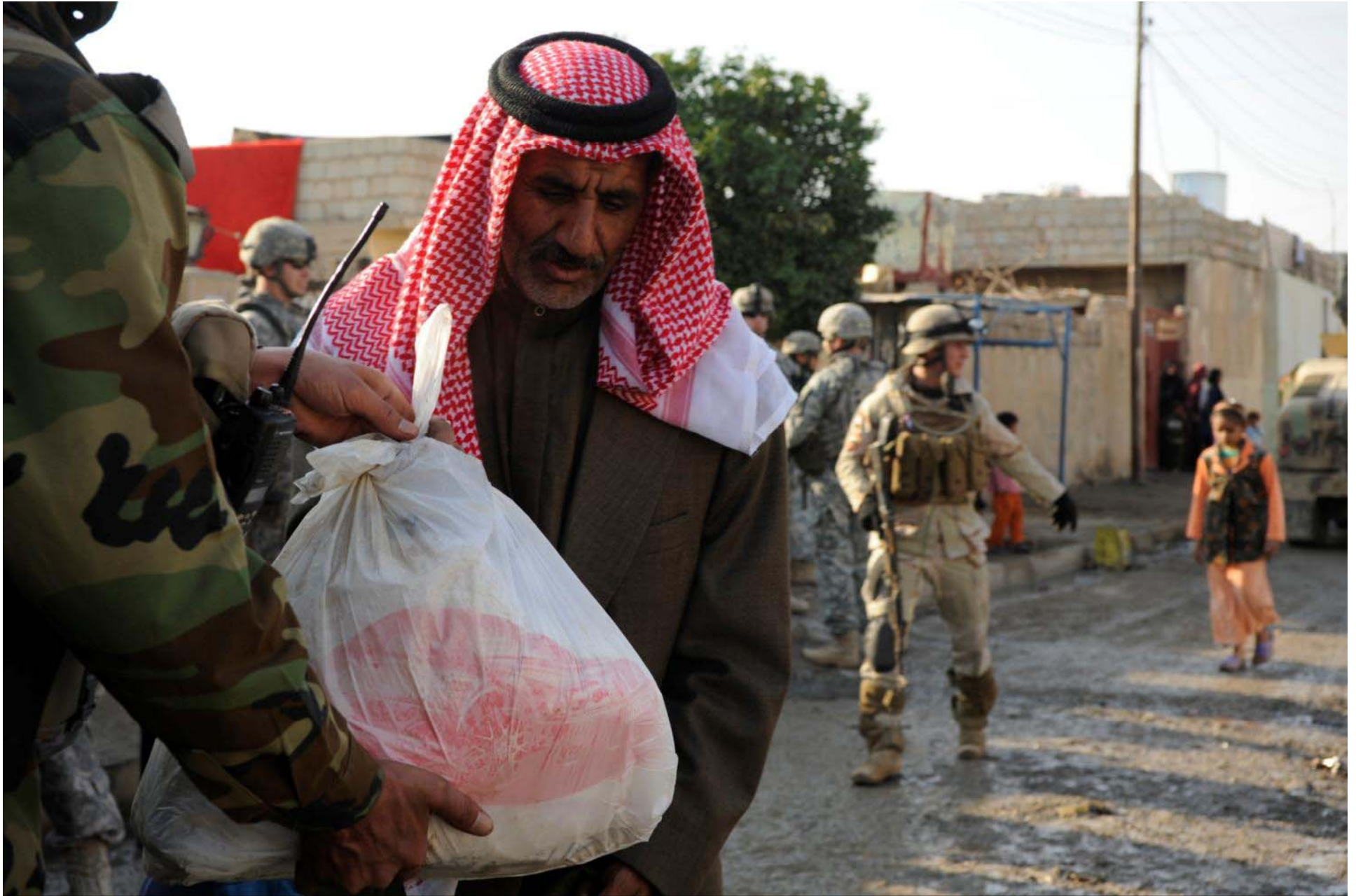
An Iraqi man receives a bag of food from 3rd Battalion, 6th Brigade, 2nd Division Iraqi Army, during a humanitarian aid mission in the Hay Al Tinek neighborhood of Mosul, Iraq, Nov. 24, 2008.

081124-F-5855M-074