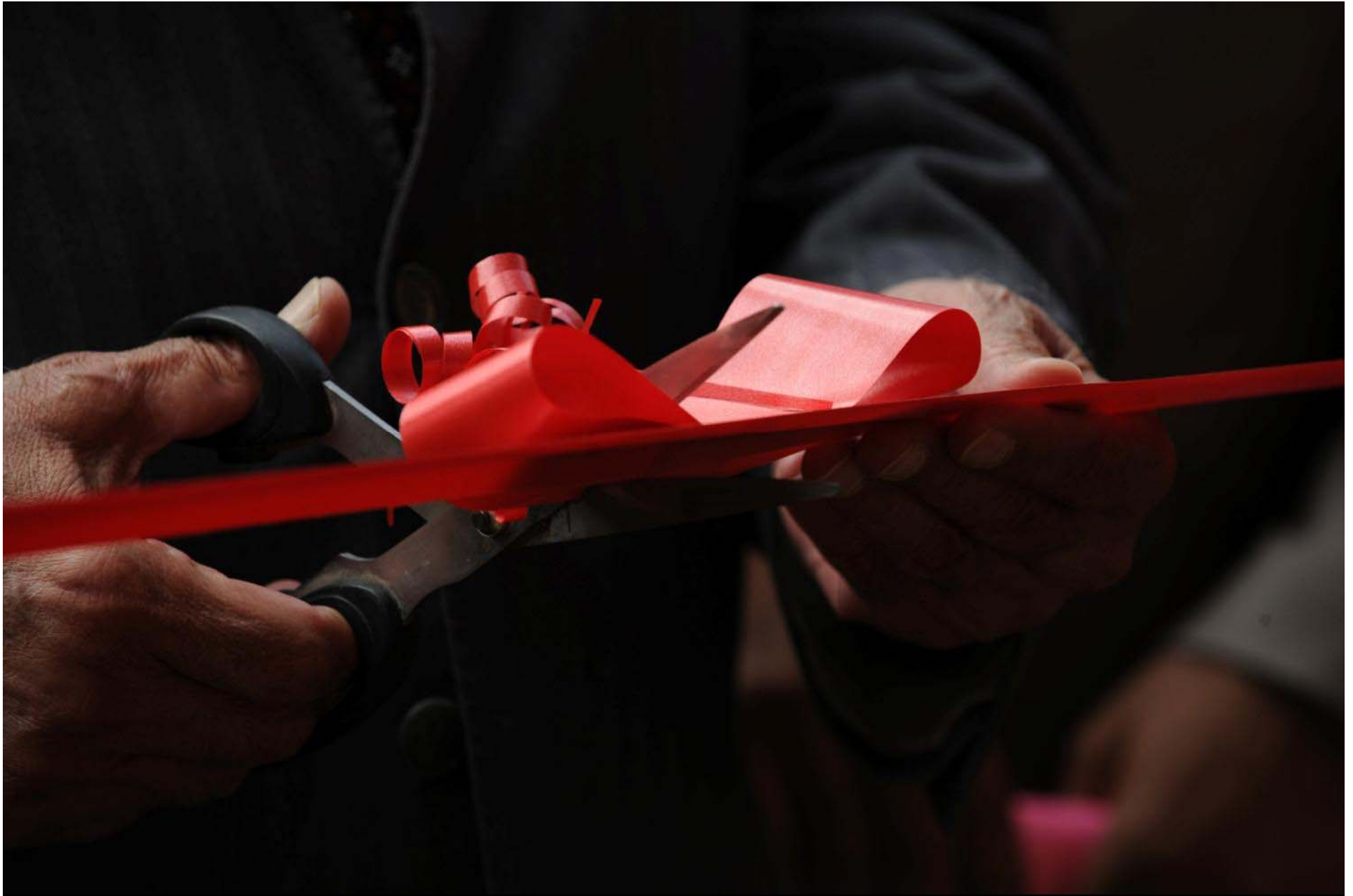
A local Iraqi Official cuts the ribbon on the front door to the recently finished government building in the city of Abu Ghraib, Iraq, Nov. 22, 2008.

081122-A-5493S-221