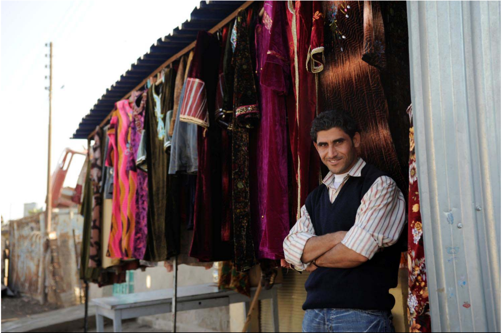
An Iraqi man stands next to his clothing store in the Hay Al Tinek neighborhood of Mosul, Iraq, Nov. 24, 2008.

081124-F-5855M-009