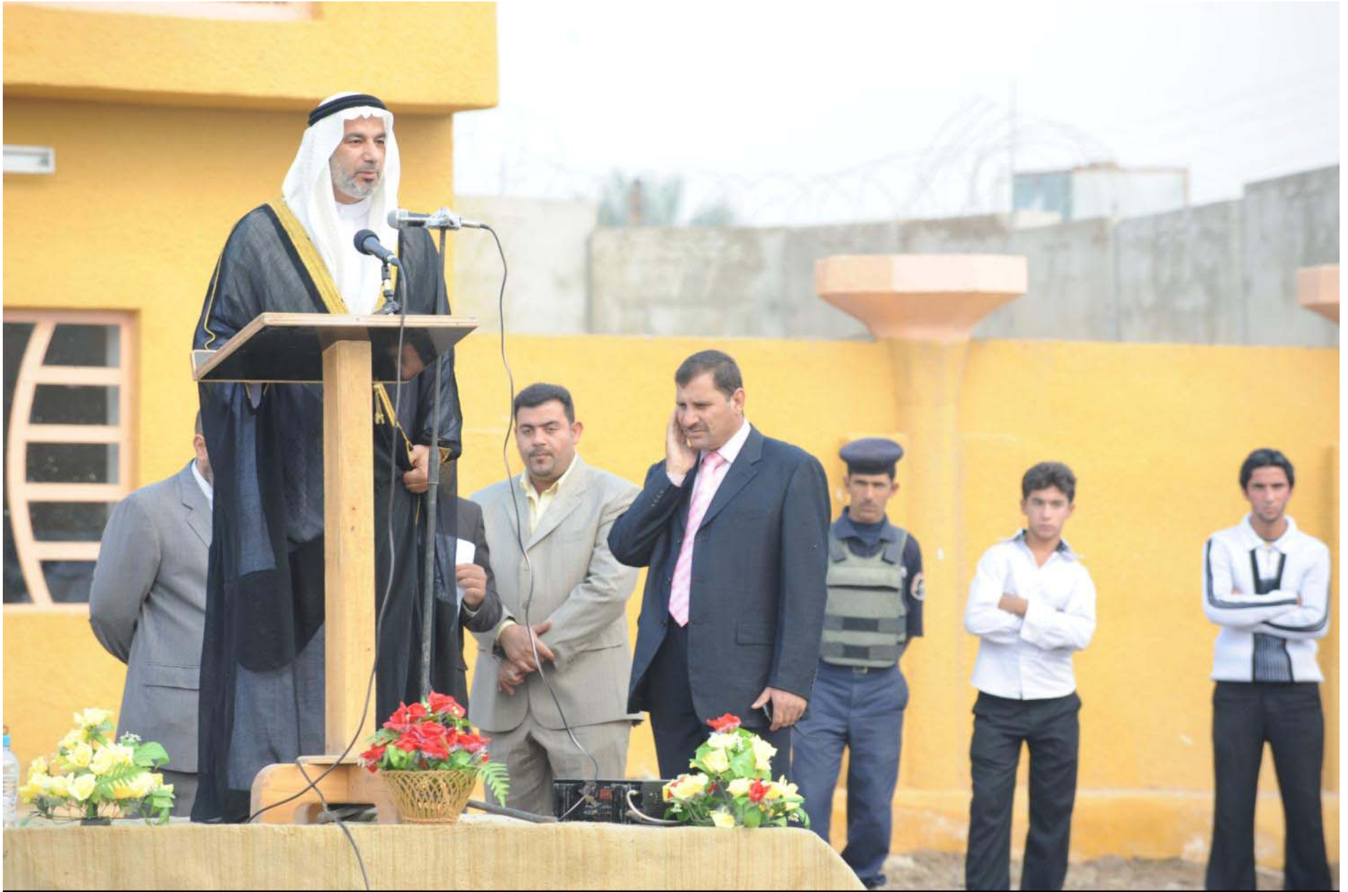
An Iraqi shaykh says a prayer at the beginning of an opening ceremony for a recently finished government center in the city of Abu Ghraib, Iraq, Nov. 22, 2008.

081122-A-5493S-155