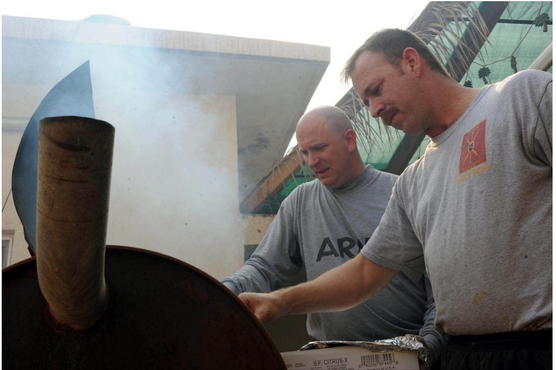
U.S. Soldiers from 2nd Stryker Brigade Combat Team, 25th Infantry Division, Military Transitional Team, attached to 24th Brigade, 6th Iraqi Army Division, celebrate the end of their year rotation to Iraq with a cookout and to welcome the incoming team that's replacing them at Forward Operating Base Constitution, Iraq, Nov. 23, 2008. 081123-A-5493S-009