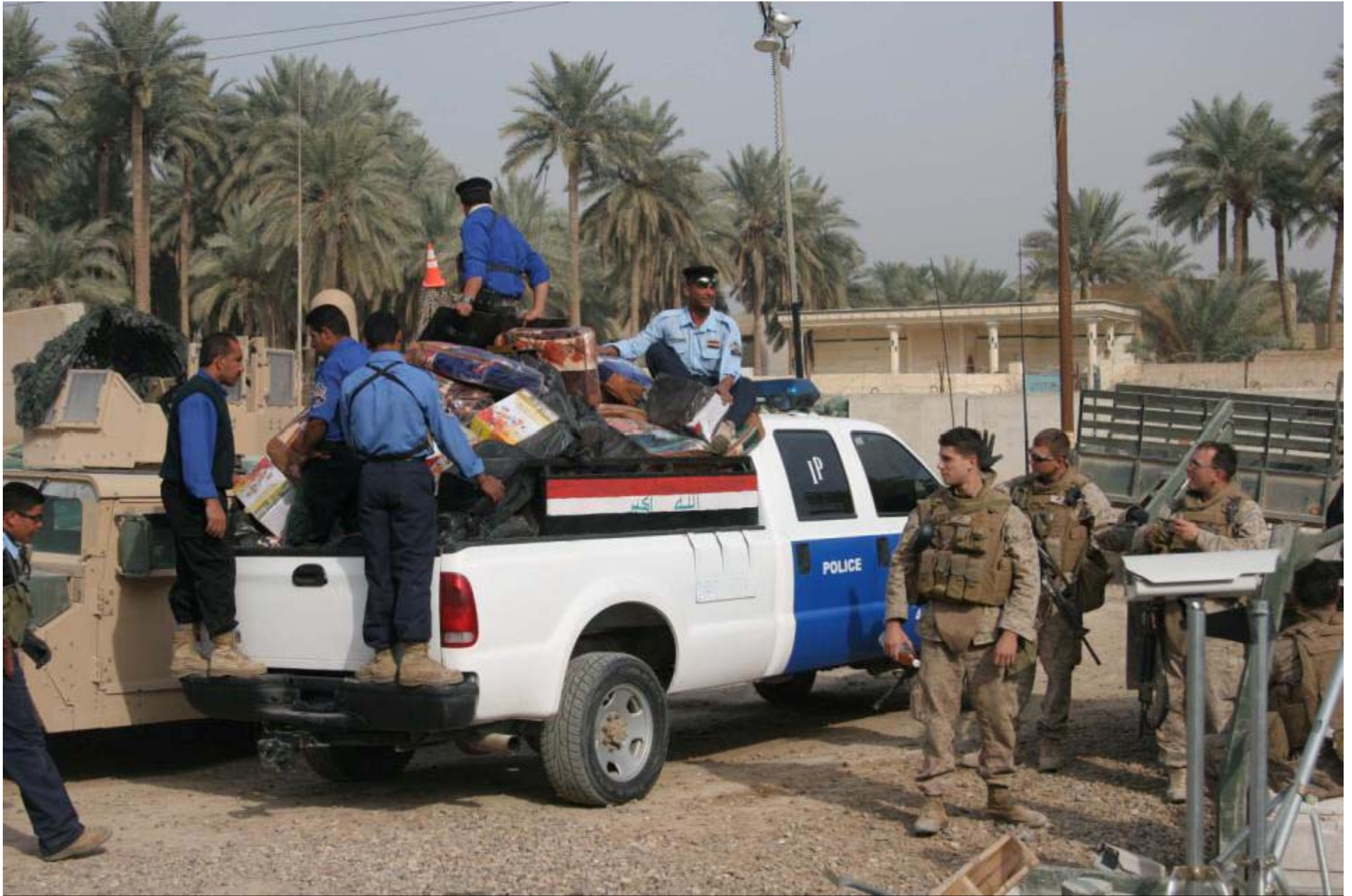
U.S. Marines with 2nd Battalion, 9th Marine Regiment, Regimental Combat Team 1 (RCT-1) give blankets, heaters, and clothing to Iraqi Police (IP) to hand out in Ramadi, Iraq Dec 4, 2008. The IPs will give the supplies to needy families in the area to help build their reputation in the city.

081210-M-6770H-042