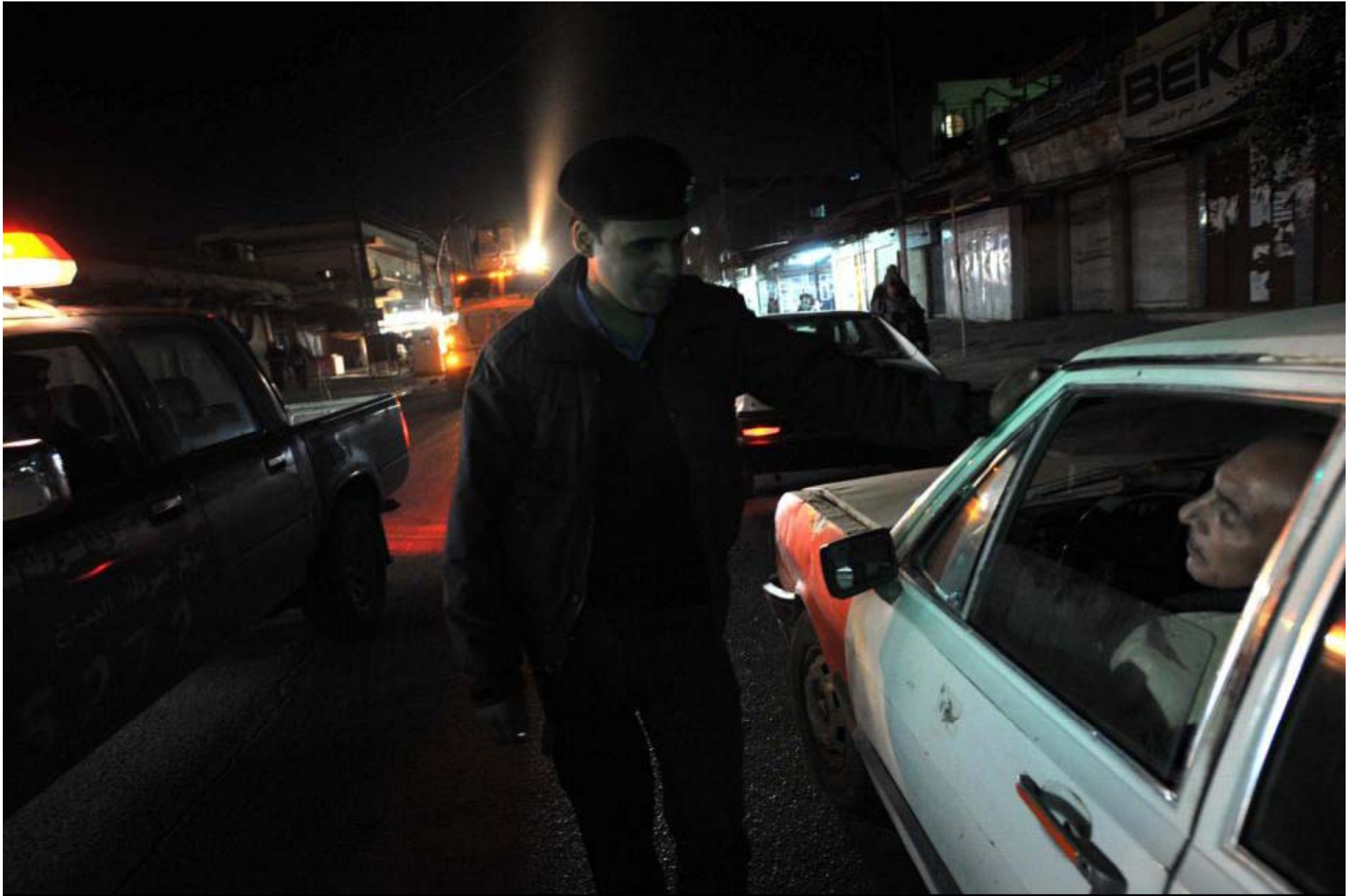
Iraqi Policemen take part in a walking patrol meeting Iraqi civilians and handing out leaflets in the Sadiyah district of southern Baghdad, Iraq, Dec. 17, 2008.

081217-N-1810F-672