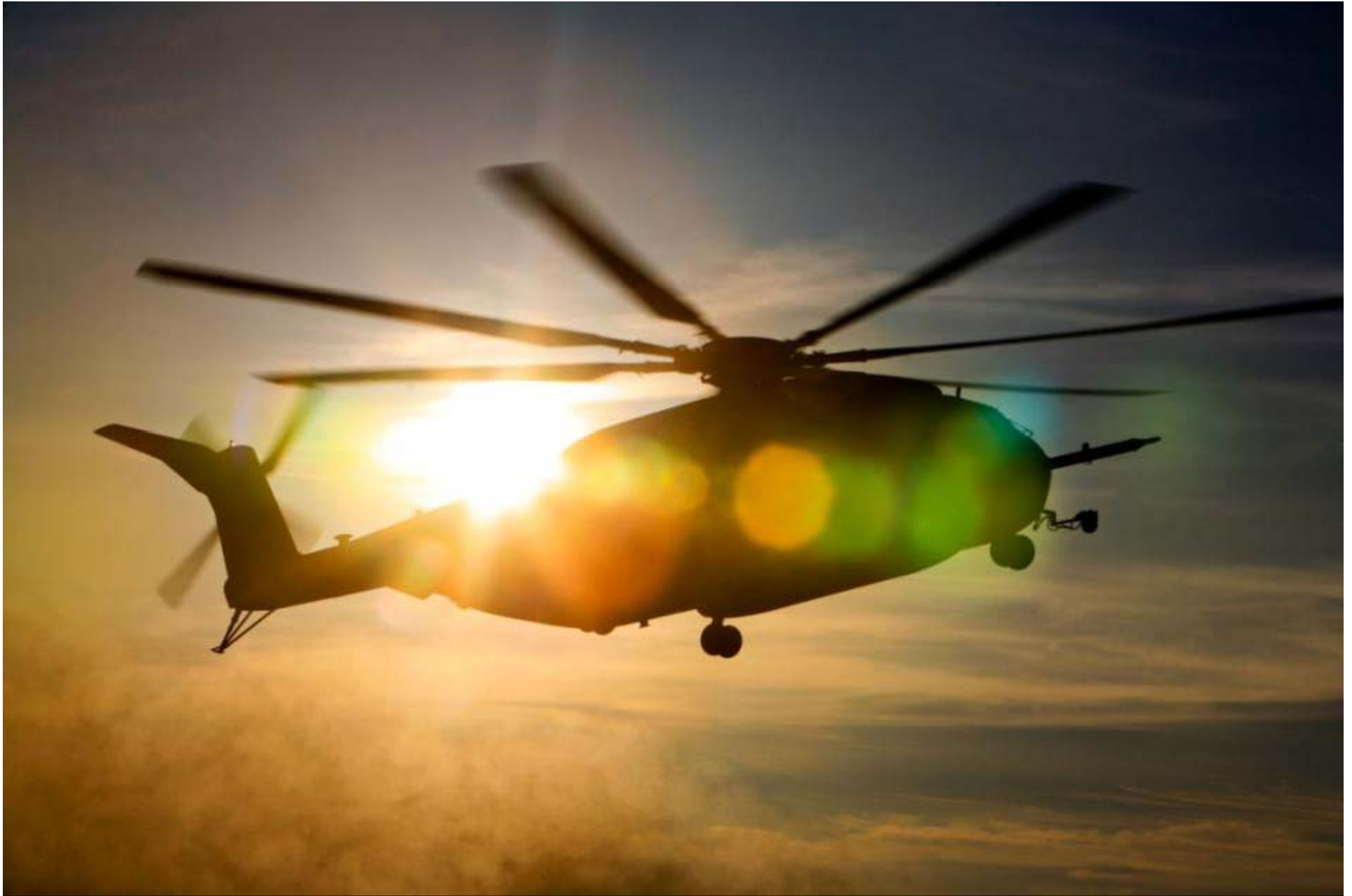
A CH-53 Sea Stallion lands at the Jump Command Post (CP) in Ninewa, Iraq, Dec. 5, 2008. The Jump CP is the command and control for all units operating in the temporary area of operations Tripoli.

081205-M-0074F-072