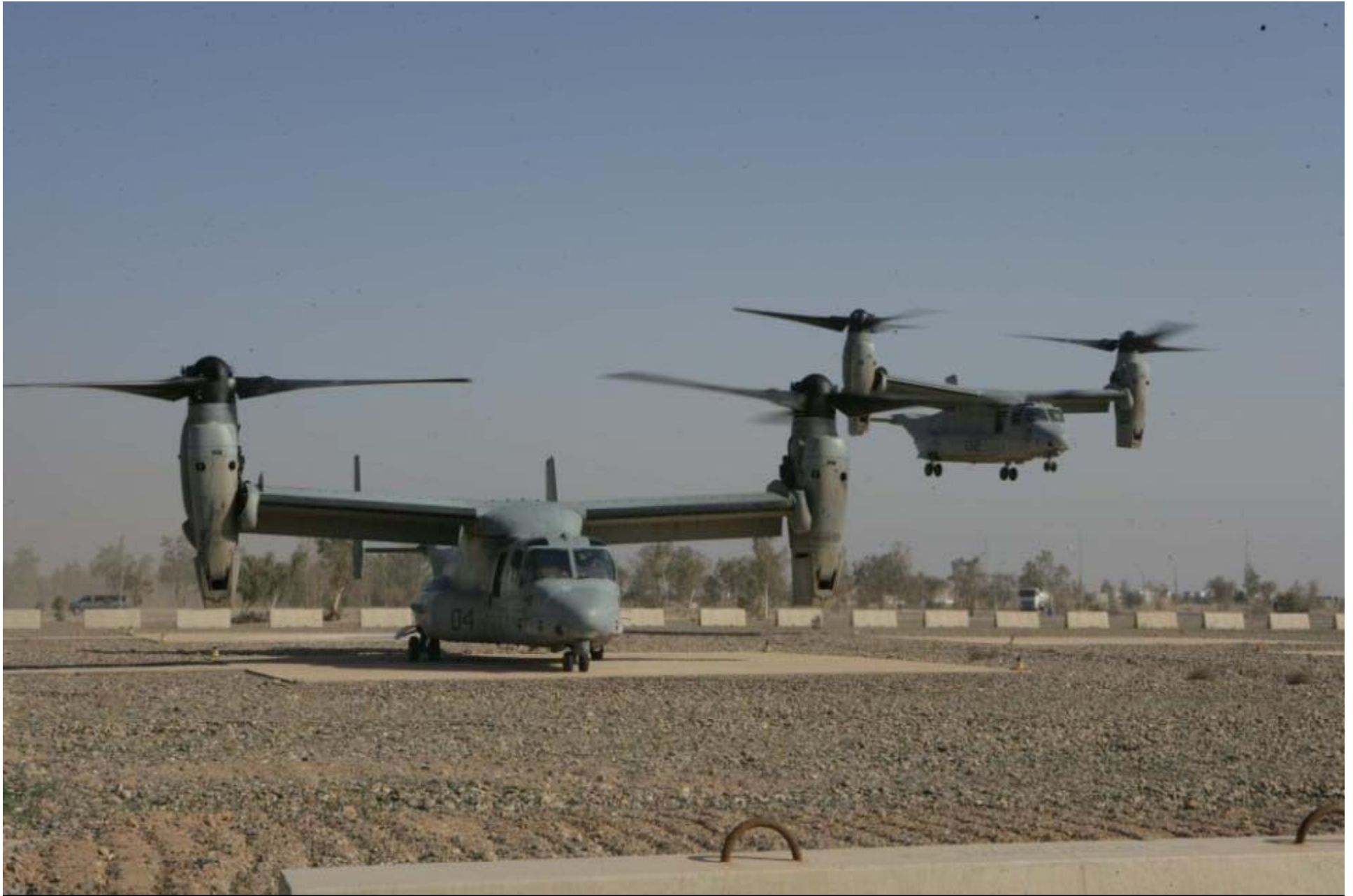
MV-22 Ospreys flown by U.S. Marines from Marine Medium Tiltrotor Squadron 266 (VMM-266) land at Contingency Operating Base Speicher, Tikrit, Iraq, Dec. 9, 2008. VMM-266 is flying to Speicher to pick up U.S. Marines (not shown) from Multi National Force - West.

081209-M-6668G-091