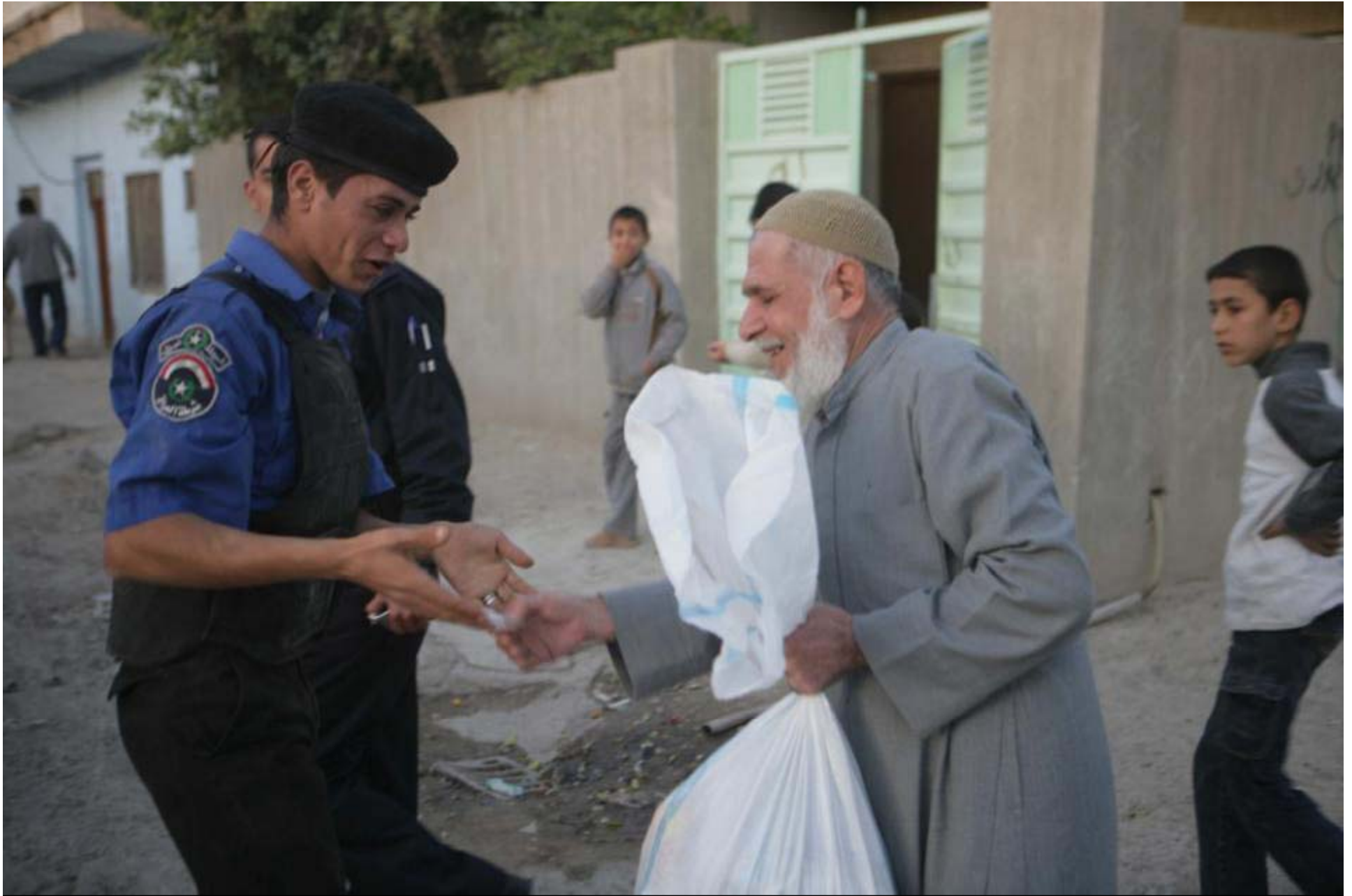
An Iraqi Policeman hands an Iraqi citizen a food bag in the Andaloos Precinct of Al Fallujah, Iraq, Dec. 5, 2008. The Iraqi Police are handing out flyers and food bags in response to the attacks in Al Fallujah on Dec. 4, 2008.

081205-M-6687W-073