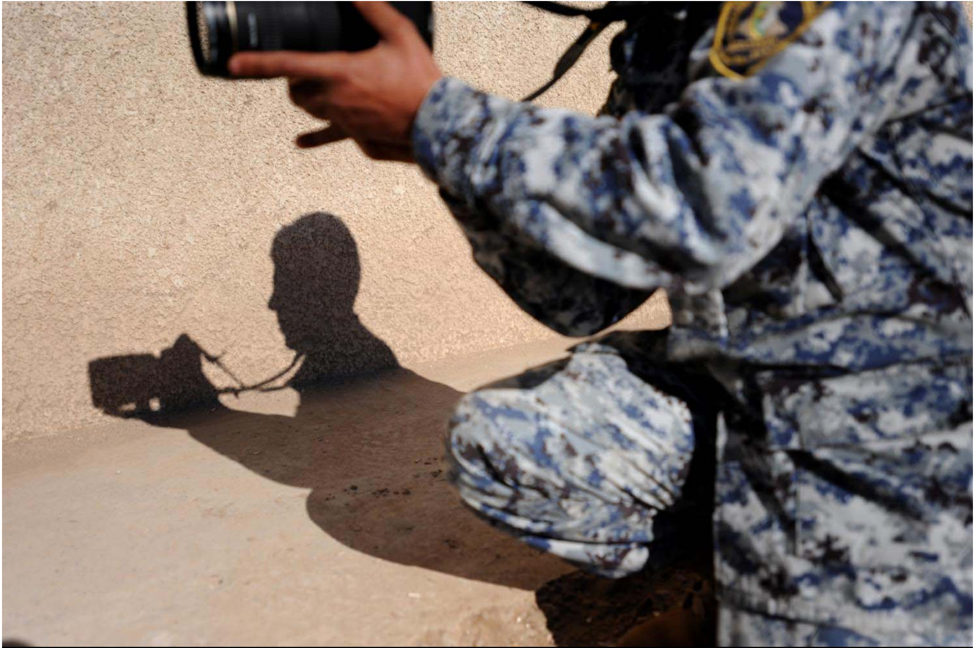
An Iraqi Policeman attending the very first Iraqi Combat Camera Training Course taught by Joint Combat Camera Iraq, Multi-National Division-Baghdad, takes a photo while on a practical exercise on the third day of training at Joint Security Station Dora, in the city of Baghdad, Iraq, Dec. 29, 2008. This is the very first training class for the program developed and fielded by several members assigned to Joint Combat Camera Iraq. 081229-A-5493S-284