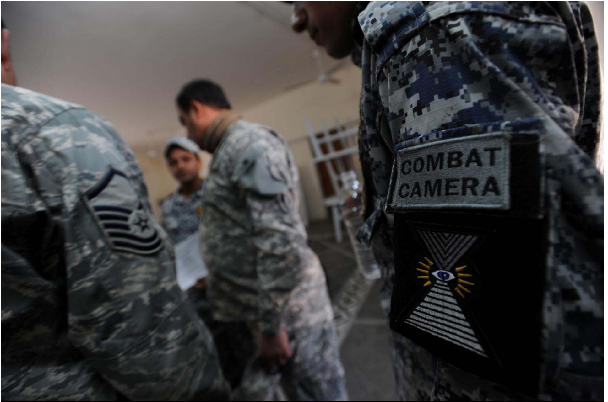
An Iraqi Police Combat Cameraman wears his new designation patch awarded to him on graduation day of the very first Iraqi Combat Camera Training Course taught by a mobile training team from Joint Combat Camera Iraq, Multi-National Division-Baghdad, at Joint Security Station Dora, in the city of Baghdad, Iraq, Dec. 30, 2008.

081230-A-5493S-204