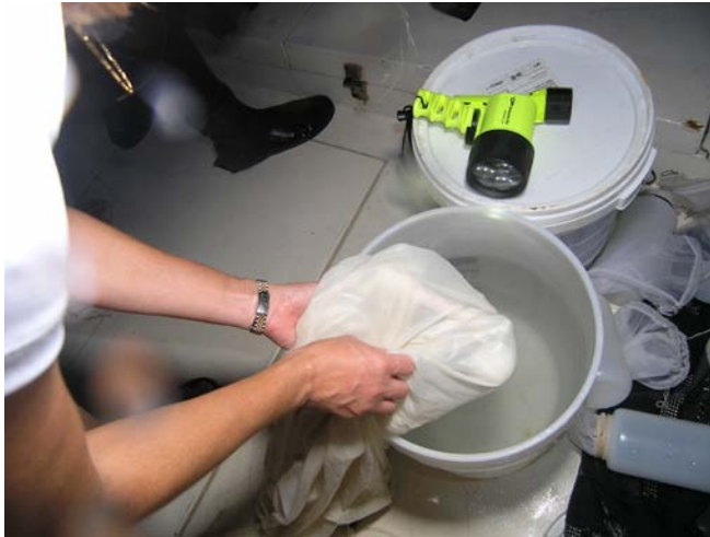
Gametes are collected and placed in buckets for transport back to NCRI.