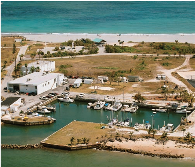
The NCRI facility at Nova Southeastern University in Ft. Lauderdale, Fla.

Departing at dusk on August 23 from Nova Southeastern University Oceanographic Center, the scientists anchored at pre-selected sites and entered the water around 6:00 pm.