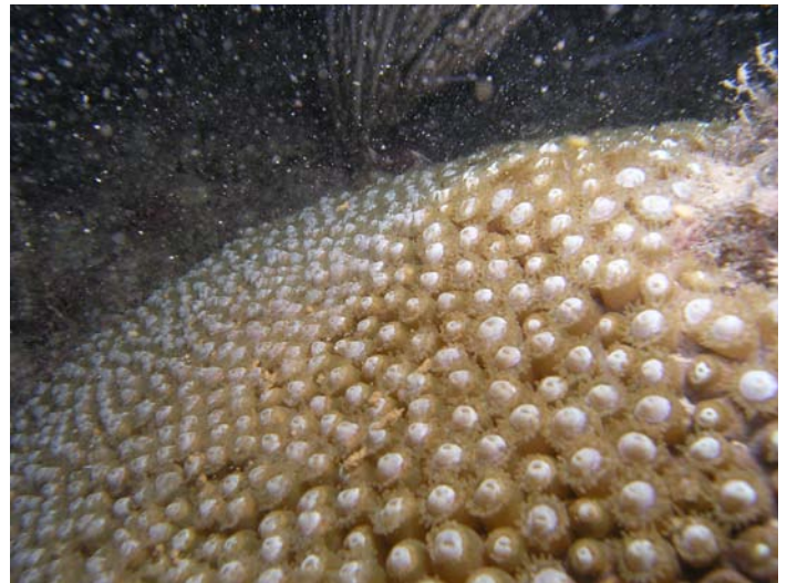
A star coral releases its gametes into the water.

colonies to catch the buoyant eggs as they floated to the surface after being released. Collection of sperm is a bit trickier since sperm quickly disperse in the water upon release instead of floating to the surface like the positively buoyant eggs. Thus, divers equipped with plastic bags were stationed near the male colonies, poised to scoop up as much as they could as clouds of sperm were released from the male colonies.