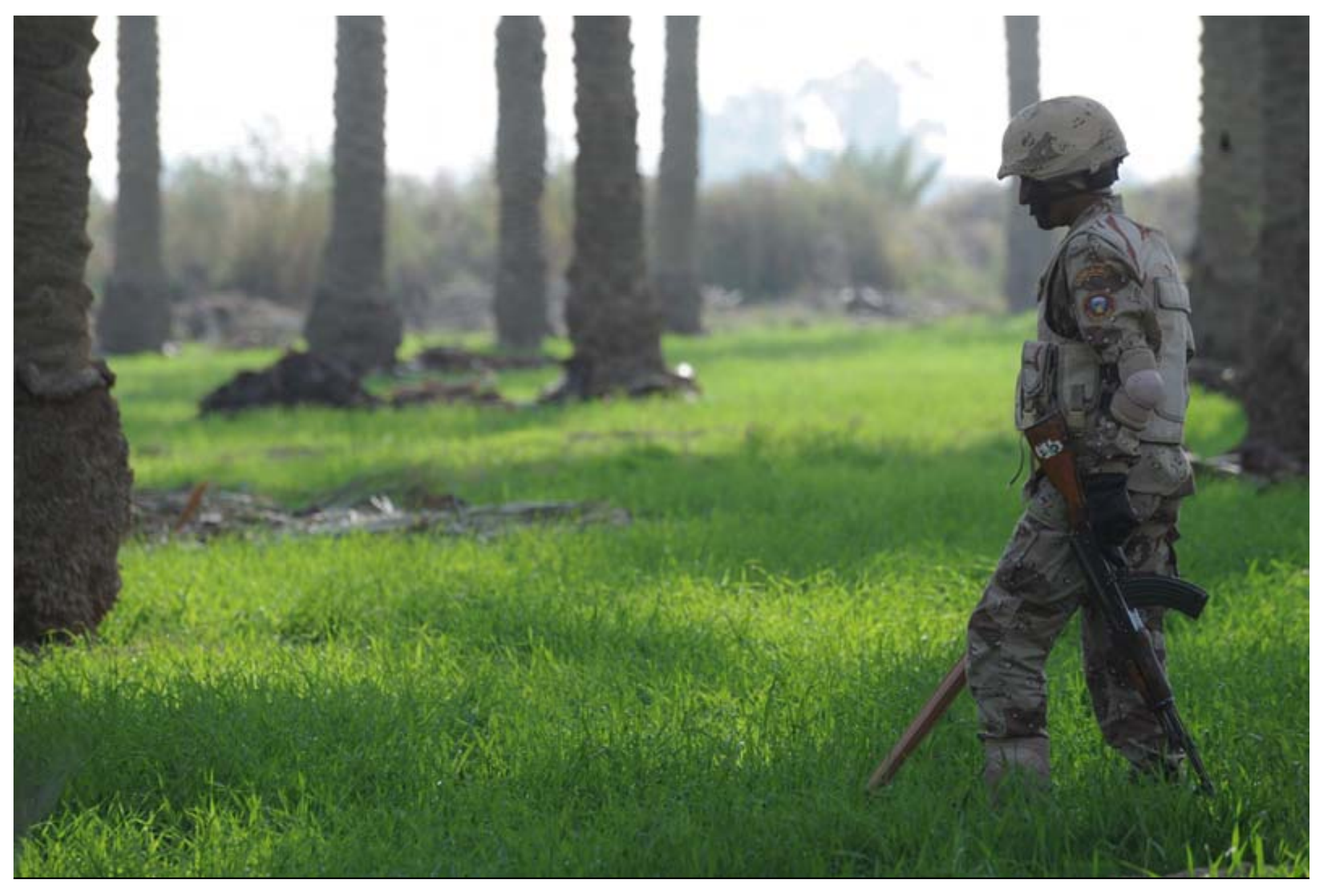
An Iraqi soldier, from 17th Iraqi Army Division, uses a metal detector to search for possible weapon caches in the village of Smahill, Iraq, on Nov. 28, 2008. U.S. Soldiers, from Alpha Battery, 4th Battalion, 27th Field Artillery Regiment, 2nd Brigade Combat Team, 1st Armored Division, trained the Iraqi soldiers on how to use the metal detectors effectively. 081128-A-8201K-046