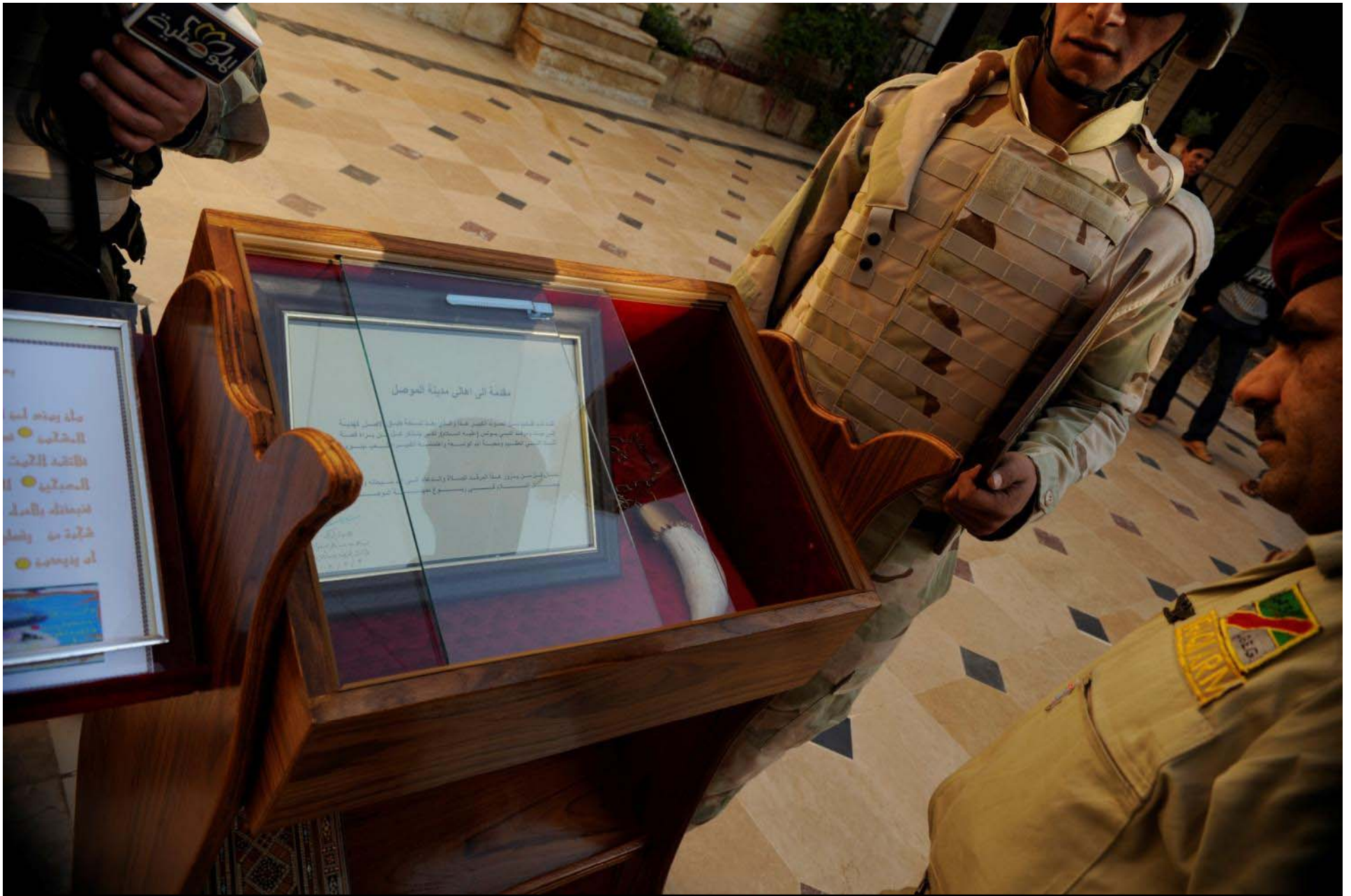
Iraqi soldiers from the 2nd Division, Iraqi Army, prepare the case that will hold a museum quality replica whale tooth, replacing the long lost real whale tooth, at the Shrine of Jonah, in Mosul, Iraq, Nov. 30, 2008.

081130-F-5855M-093