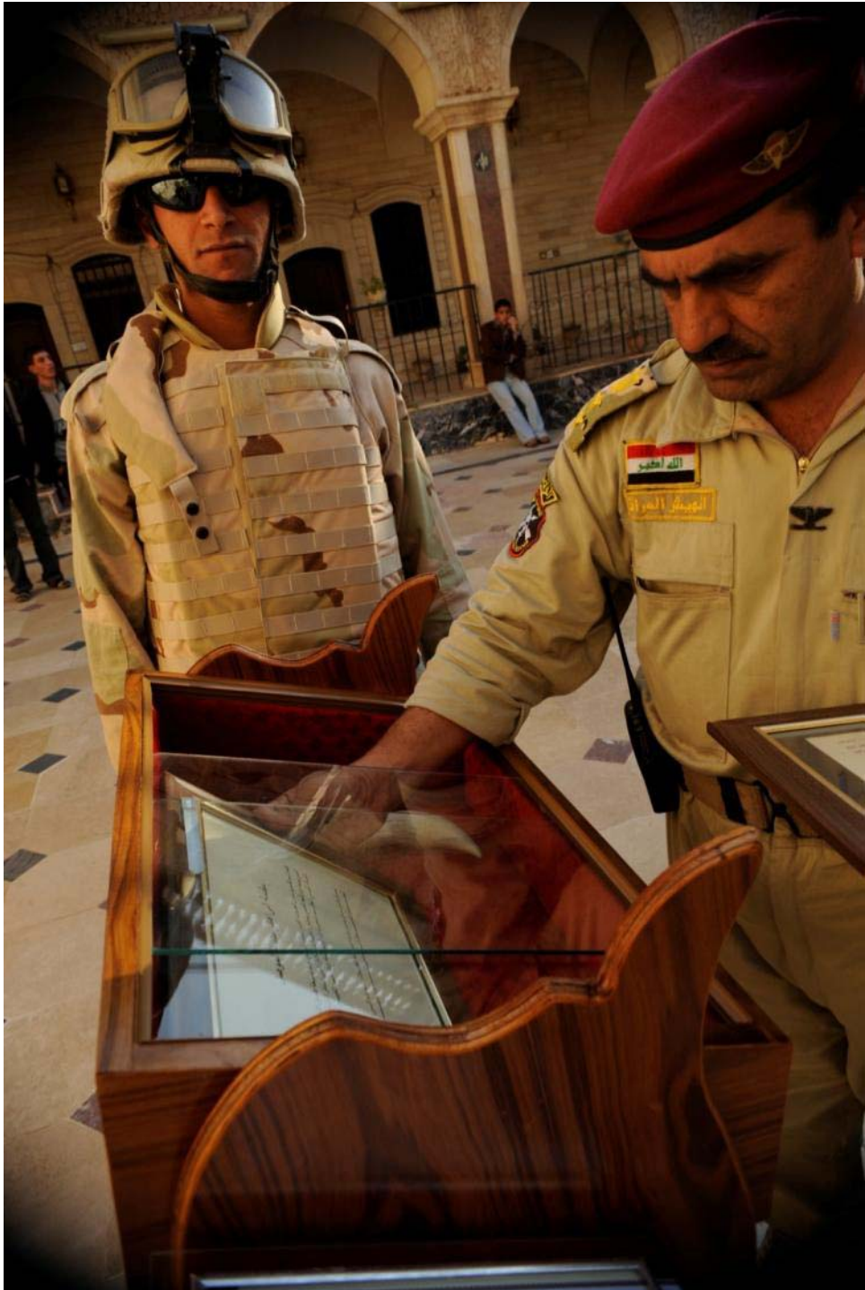
Iraqi soldiers from the 2nd Division, Iraqi Army, prepare the case that will hold a museum quality replica whale tooth, replacing the long lost real whale tooth, at the Shrine of Jonah, in Mosul, Iraq, Nov. 30, 2008.