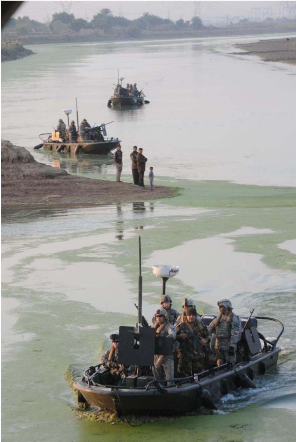
U.S. Army Scouts of Bandit Troop, 1st Squadron, 9th Cavalry Regiment, from 4th Brigade Combat Team, 1st Cavalry Division, patrol the Tigris River in Southern Maysan Province, Iraq. They are assisted by the Iraqi soldiers of the Iraqi 1st Battalion, and local Iraqi Police, Dec. 1, 2008.