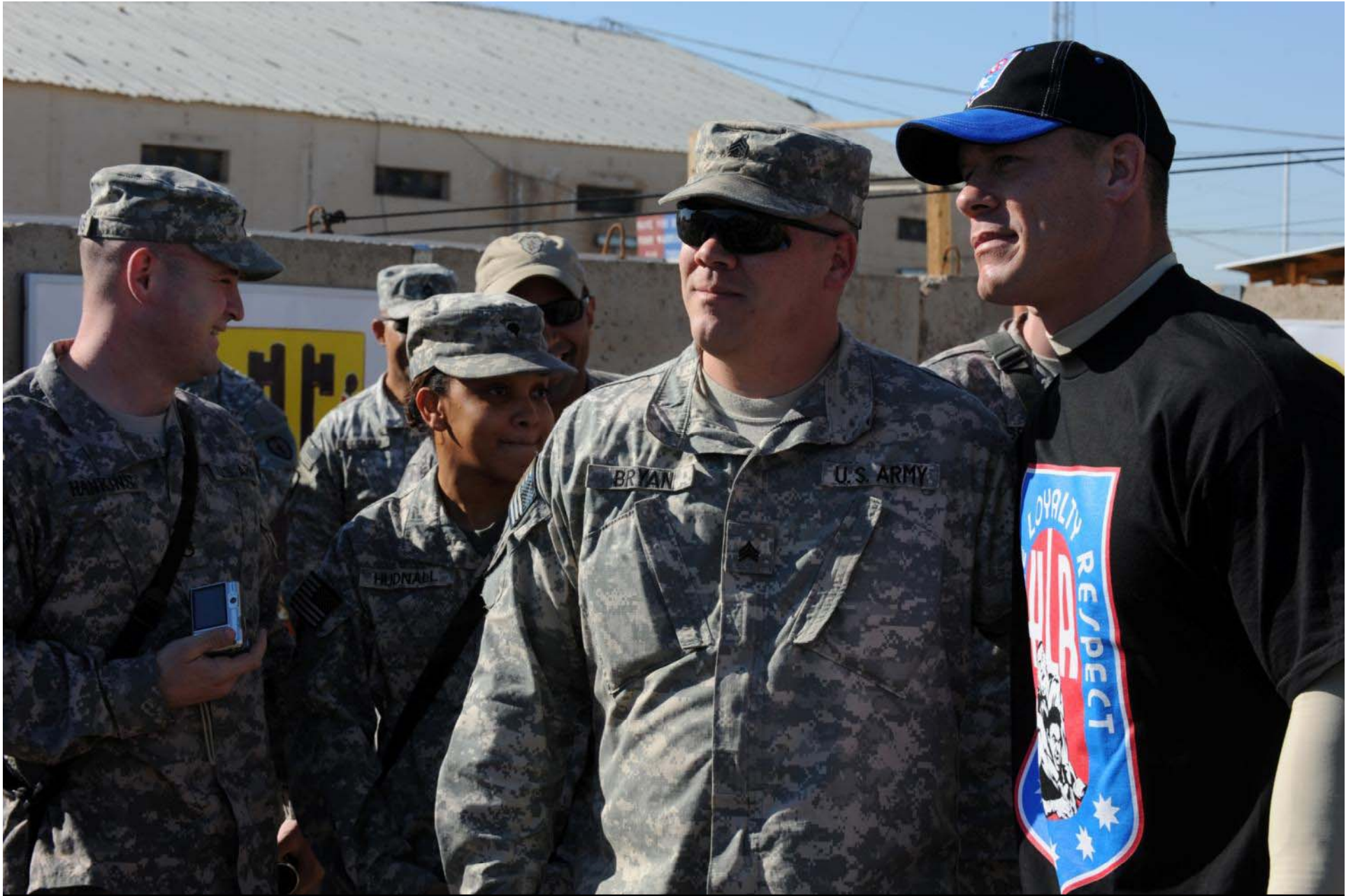
World Wrestling Entertainment Wrestler John Cena, on a trip with the USO to the middle east, visits with U.S. Soldiers assigned to the 2nd Stryker Brigade Combat Team, 25th Infantry Division, Multi-National Division-Baghdad, during a stop at Camp Taji, Iraq, Dec. 4, 2008.

081204-A-5493S-020