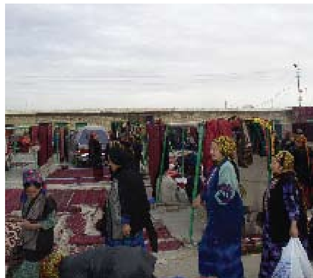
Women at a market in Turkmenistan.

No religious literature is printed in Turkmenistan and the import of religious materials is essentially impossible.