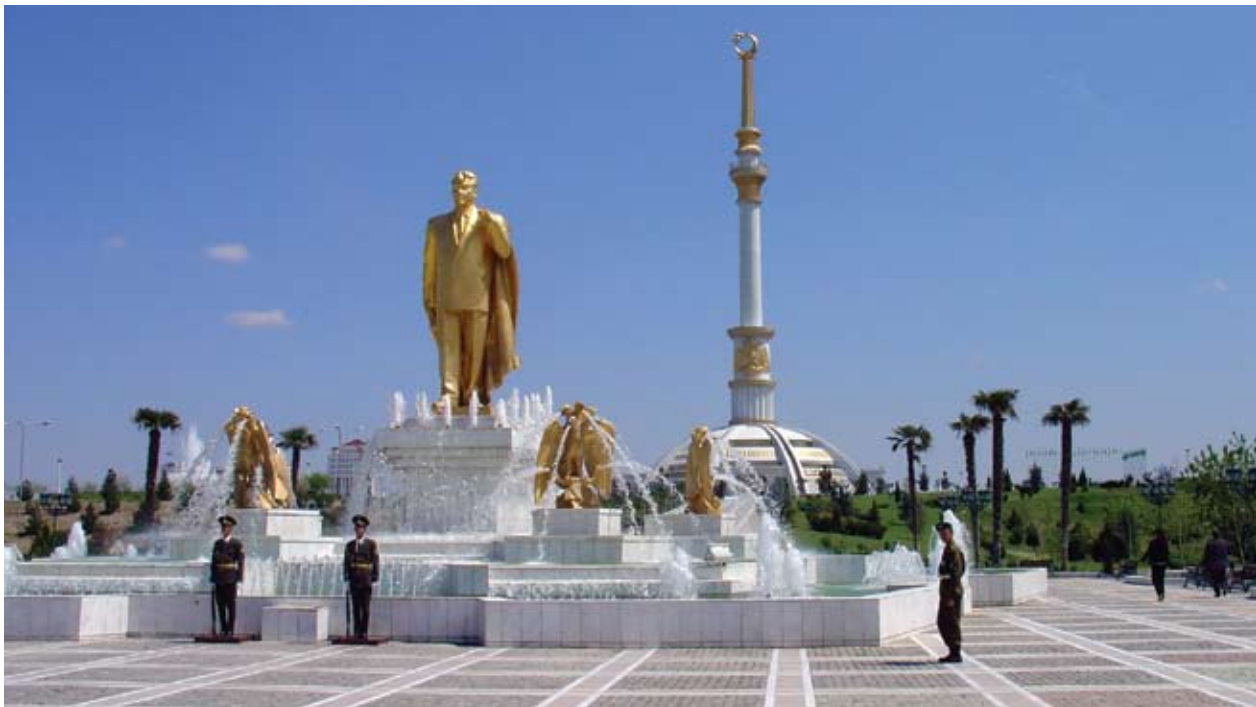
A statue of the late Turkmen leader Saparmurat Niyazov in Ashgabat

President Niyazov's personality cult, which had become comparable to a state-imposed religion, was bolstered by the official imposition of his book of "spiritual thoughts," the Rukhnama . According to the State Department, the Rukhnama had been used "in part to supersede