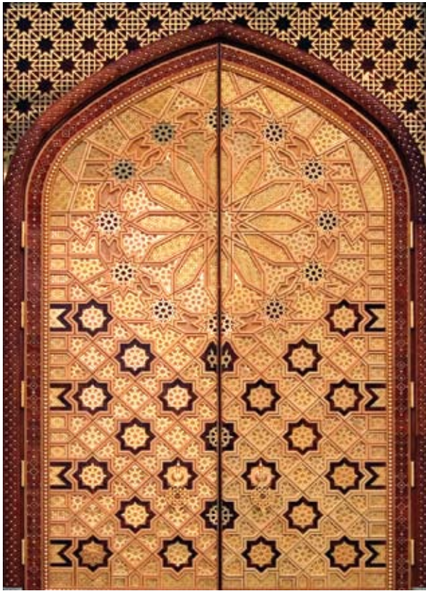
Kipchak Mosque, Ashgabat

vember 2005. Yet, Turkmen authorities refuse to allow the Russian Orthodox community to build a new cathedral in the capital of Ashgabat, though Niyazov allocated land for that purpose 10 years ago. According to the Forum 18 News Service, final construction work on the community-funded convent next to St Nicholas' Church in Ashgabat was halted in late 2005, after Niyazov allegedly privately warned Orthodox clergy that if construction went ahead he would order demolition of all the country's Orthodox churches. In addition, the Turkmen government has attempted to isolate local parishes from the Russian Orthodox Church, in part by pressuring the local Church to take Turkmenistan's parishes from the jurisdiction of the Central Asian diocese in Uzbekistan and put them under the Patriarch of Moscow, which in July 2005 rejected this proposal.