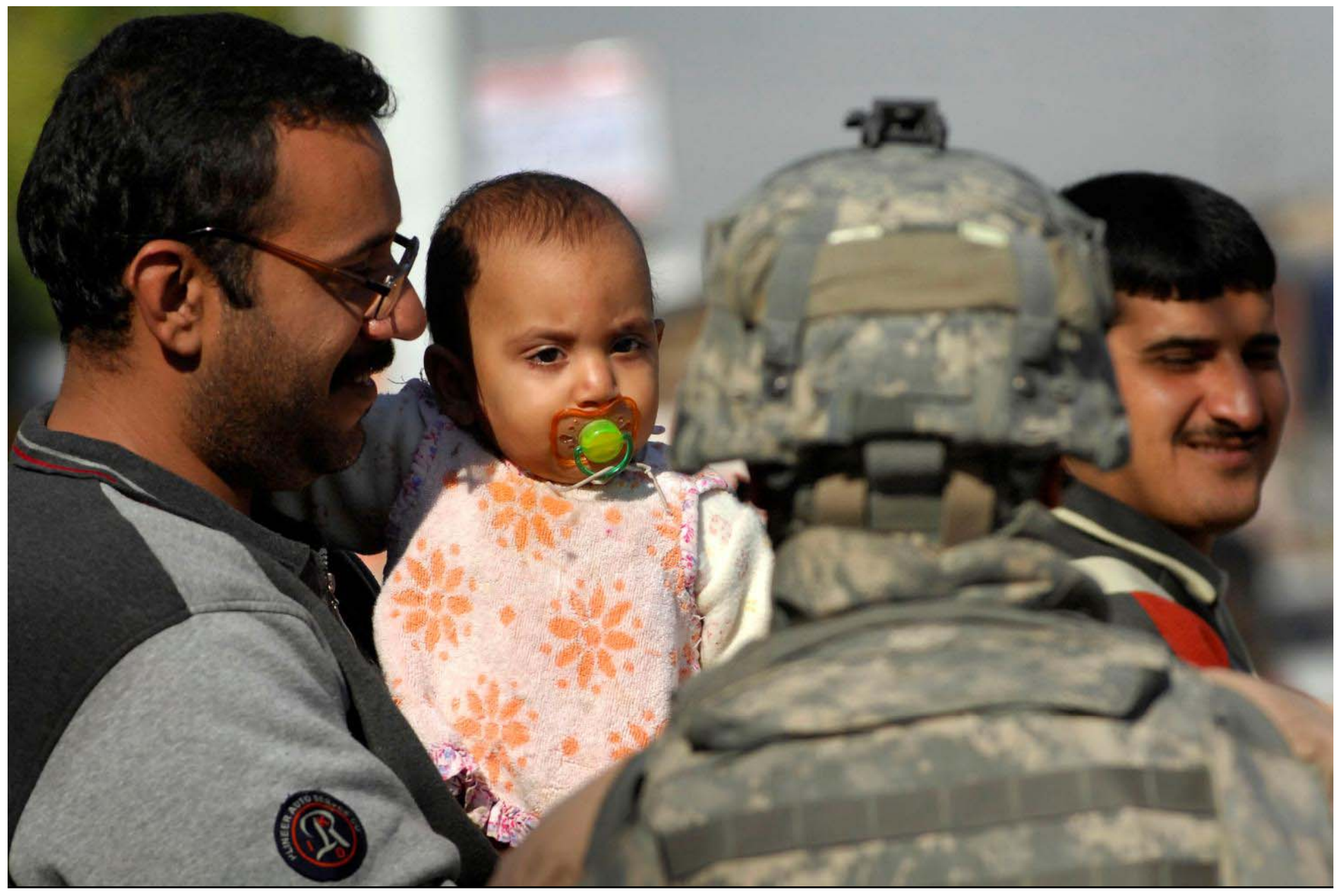
U.S. Air Force Security personnel greet Iraqi civilians during a walking patrol in the Rashid community of southern Baghdad, Iraq, Dec. 4, 2008. The Airmen are assigned to Squadron 11, Detachment 3, 732 Expeditionary Security Forces Squadron, 1st Brigade Combat Team, 4th Infantry Division.

081204-N-1810F-147