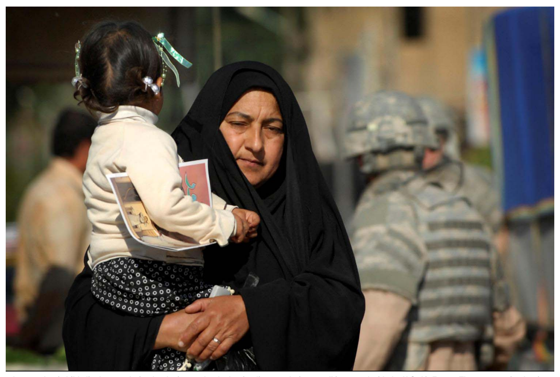
A young Iraqi child clinches a coloring book given to her by Iraqi policemen during a walking patrol with the U.S. Air Force. They are meeting Iraqi civilians and handing out leaflets in the Rashid community of southern Baghdad, Iraq, Dec. 4, 2008. The Airmen are assigned to Squadron 11, Detachment 3, 732 Expeditionary Security Forces Squadron, 1st Brigade Combat Team, 4th Infantry Division. 081204-N-1810F-069