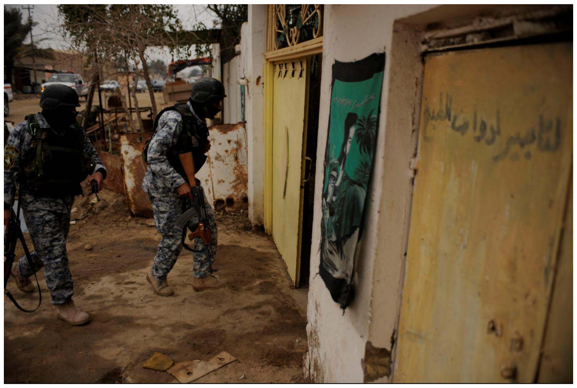
Iraqi police enter a house in search of suspected criminals during Cordon and Search operations in Diwaniyah, Iraq, Dec. 10, 2008. The Iraqi army and Iraqi police work together to complete the operation.