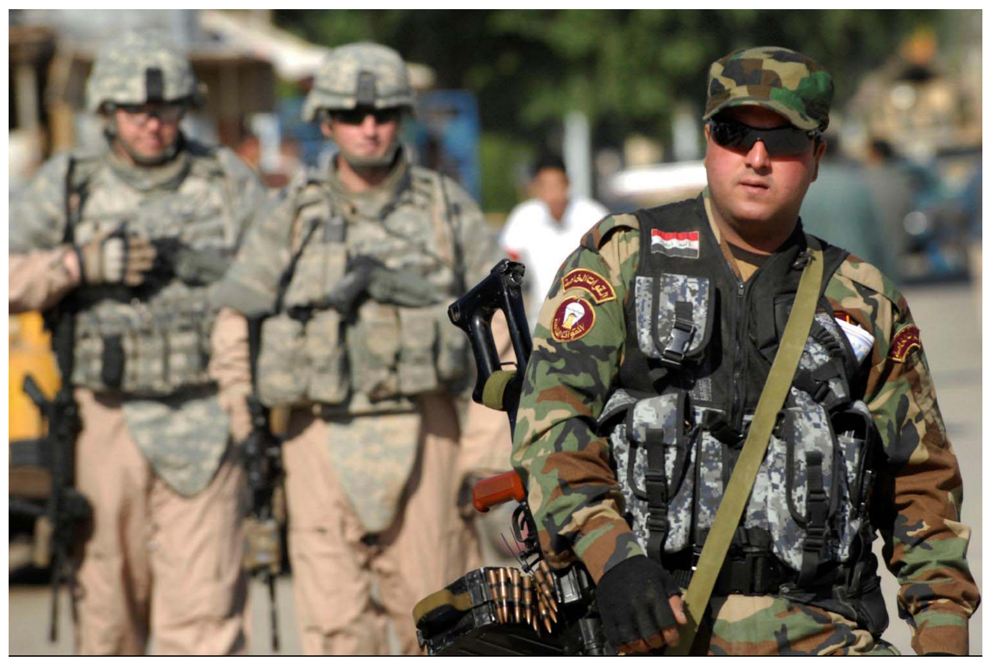
U.S. Air Force Security personnel accompany an Iraqi national policeman of the criminal investigations division on a walking patrol. They are meeting Iraqi civilians and handing out leaflets in the Rashid community of southern Baghdad, Iraq, Dec. 4, 2008. The Airmen are assigned to Squadron 11, Detachment 3, 732 Expeditionary Security Forces Squadron, 1st Brigade Combat Team, 4th Infantry Division. 081204-N-1810F-077 UNCLASSIFIED