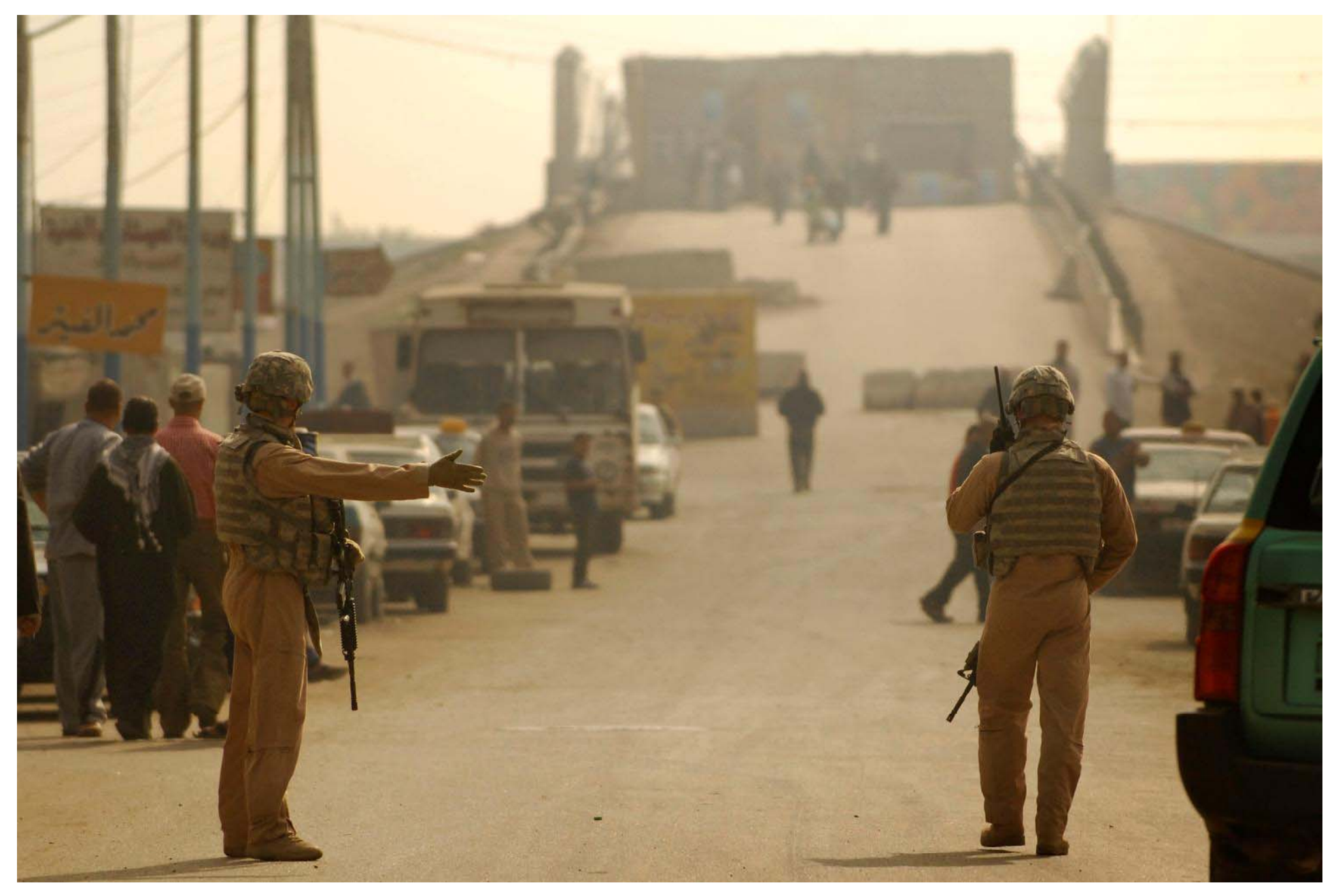
U.S. Airmen assigned to 11th Security Forces Squadron, Detachment 3, 732nd Expeditionary Security Forces Squadron, 1st Brigade Combat Team, 4th Infantry Division, communicate with Iraqi policeman during a response to a possible Improvised Explosive Device, Nov. 22, 2008, in the Doura community located in southern Baghdad, Iraq.