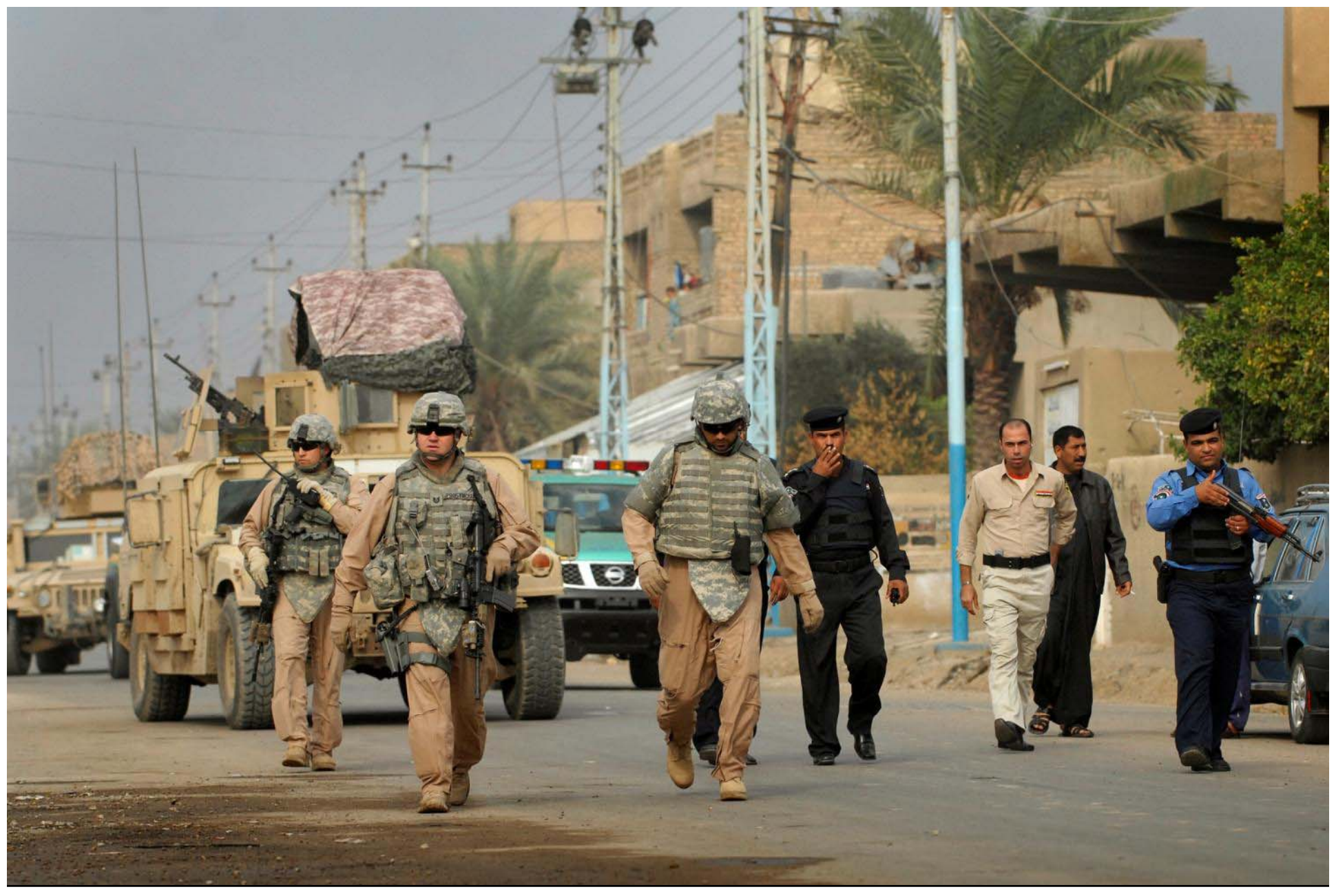
U.S. Airman assigned to 11th Security Forces Squadron, Detachment 3, 732nd Expeditionary Security Forces Squadron, along with Iraqi police and Sons of Iraq soldiers, respond to a possible Improvised Explosive Device, Nov. 22, 2008, in the Doura community located in southern Baghdad, Iraq.