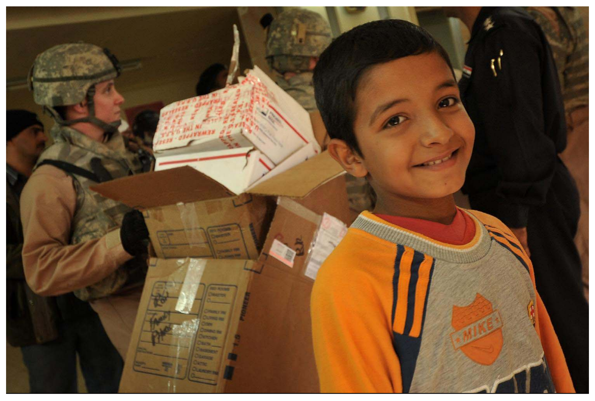
An Iraqi child smiles after Iraqi police and U.S. Airmen after receiving gifts during the delivery of school supplies and soccer balls to his elementary school, Nov. 22, 2008, in the Doura community located in Baghdad, Iraq. U.S. Airmen assigned to 11th Security Forces Squadron, Detachment 3, 732nd Expeditionary Security Forces Squadron, 1st Brigade Combat Team, 4th Infantry Division, supported the humanitarian mission. 081122-N-1810F-633