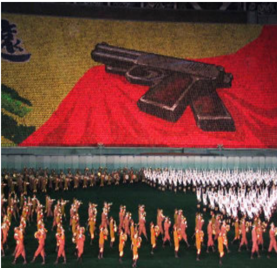
North Koreans Perform at the 2005 Arirang Festival