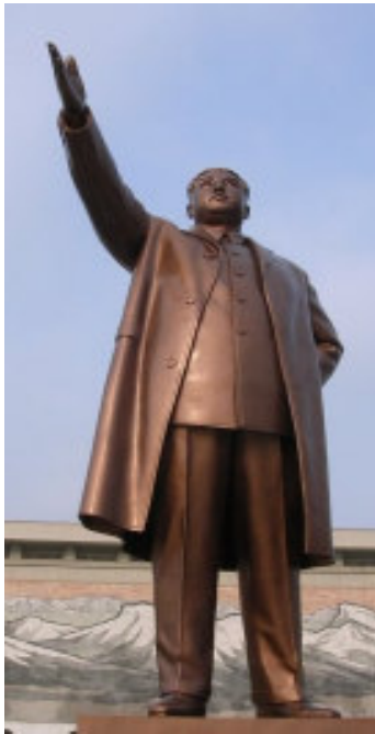
Statue of Kim Il Sung

To fill the spiritual and intellectual void created by the suppression of the existing Korean thought and belief systems in the late 1950s and 1960s, the North Korean regime constructed and substituted an esoteric belief system that has acquired many of the characteristics of a religious cult. The former North Koreans interviewed for this study were very familiar with this monolithic official ideology system, the rites and rituals of which they, like all North Koreans, were required to participate in on an almost daily basis for all of their lives until they fled North Korea. This system is called variously, “the Juche Idea” ( Juche or chuch’e sasang ), Kimilsungism, Kim Il Sung Revolutionary Thought, or “the monolithic ideology system,” ( yuil sasang chegye —also translated as “the one and only ideology system”), with these terms being used tautologically and almost inter-changeably. 138