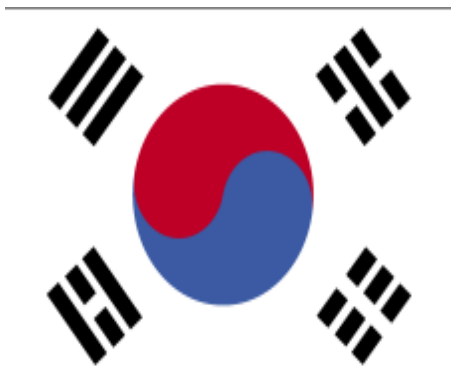
SOUTH KOREAN FLAG

Based on extensive, in-depth interviews with 40 former North Koreans who recently fled to China and South Korea, this report of the U.S. Commission on International Religious Freedom provides significantly more information than was previously available on the subject of religious freedom in North Korea. Even though the normal international monitoring capability does not exist with regard to North Korea, the information and analysis contained in this report will contribute to a more detailed understanding and awareness on the part of the international community of this particular “human rights challenge” in the DPRK. It is not surprising that the testimonies of the North Koreans interviewed indicate a wide discrepancy between what the North Korean government claims and what its citizens perceive and experience to be the case. The testimonies also show that official DPRK policies related to freedom of religion or belief affect not only the extremely small number of religious practitioners cited by the authorities, but also the entire population of North Korea.