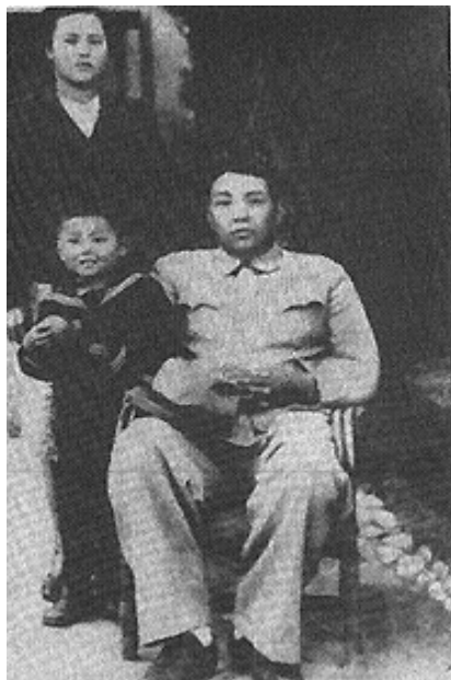
Sept. 19, 1945 - Kim Il Sung and his wife Kim Chong Suk return to Korea from Siberia.