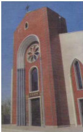
Changchung Catholic Church in Pyongyang

Various reasons have been suggested to explain the opening of these two churches when none had been allowed to operate before. One Korean-American church official interviewed for this report attributed this, first, to requests by foreign visitors to attend services, and second, to the influence of Chinese policy where, in 1977-78, church buildings that had been confiscated during the Cultural Revolution were returned to the officially recognized church bodies. 180 North Koreans had visited China often enough to be aware of this evolution of Chinese policy in the post-Mao era. Another former North Korean interviewed for this report, a high-level defector, attributed the policy change to North Korean hopes of hosting an International Youth Festival in 1988, in competition with Seoul’s hosting of the 1988 Olympic games, during which many foreigners would come to Pyongyang and the total absence of any church or Buddhist temple would be obvious.