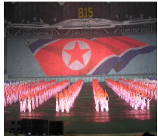
North Koreans pay tribute to their nation at the 2005 Arirang Festival.

In addition, numerous interviewees referred to several drama programs that were shown repeatedly on North Korean television. The show Seonghwangdang