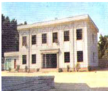
Building of the Central Committee of Korean Catholics Association

Interviewee 6 learned about Christmas from foreign films in the mid-1980s, but she had never seen any religious facilities in Onsong, North Hamgyong province.