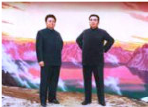
“Great Leader” and “Dear Leader” depicted in a painting

According to Kim Il Sung’s major scholarly biographer, Kim first mentioned Juche in 1955 and did not mention it again until 1963. However, under Kim Jong Il’s direction, Korean history was re-written. In the 1970s, Kim Il Sung’s speeches purportedly dating back to the 1930s were published for the first time. These previously unpublished and unheard of speeches have Kim Il Sung lecturing on Juche to Korean anti-Japanese partisans in Manchuria in 1930 at the age of 18.