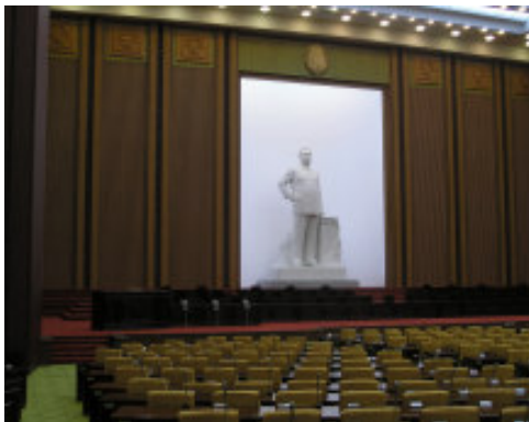
Kim Il Sung Portrait adorns a Grand Hall in Pyongyang

Interviewee 15: “Fortune telling has become very common, but people still do it in secret. If it is disclosed to the authorities, people hear abusive language, and sometimes people are arrested. I also went to a fortune teller, prompted by curiosity, when I had economic problems.”