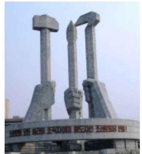
A North Korean statue depicting symbols of the hammer, the sickle, and the scholar's brush

In 1392, when the Chosun dynasty (also termed the Yi dynasty 58 ) replaced the 300 year old Koryo dynasty, Neo-Confucianist officials were able to institute a gradual, though extremely thorough, suppression of Korean Buddhism. Royal subsidies to the monasteries were ended. The position of Buddhist advisor or