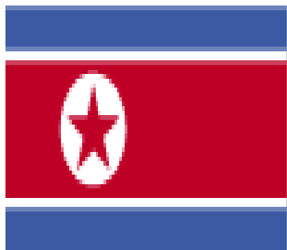
NORTH KOREAN FLAG