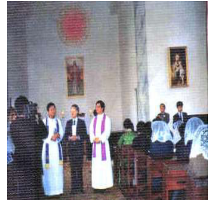
Lay Persons lead mass in North Korea’s only state approved Catholic Church

In 1988, KCF officials described their main functions to a visiting delegation of Canadian church officials. These included: (1) encouraging Christians to participate in the development of the country; (2) defending the rights of believers; (3) promoting friendly relations with political parties and social organizations; and (4) contributing to “the struggle for peace and national reconciliation.” 206