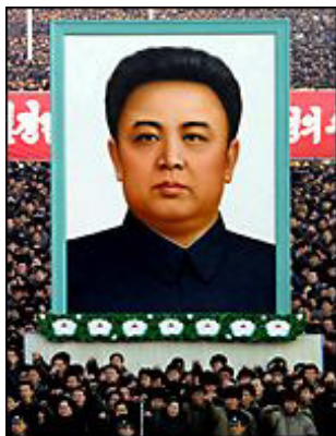
Portrait of the ‘Great Leader’ towering over North Korea people

Interviewee 13 is a young woman from a pre-Korean War Christian family. Her mother and her mother’s friends continued to gather to worship secretly in Hamhung, an industrial city near the East Sea (Sea of Japan), where many old Christian families had been exiled after the Korean War (1950-1953).