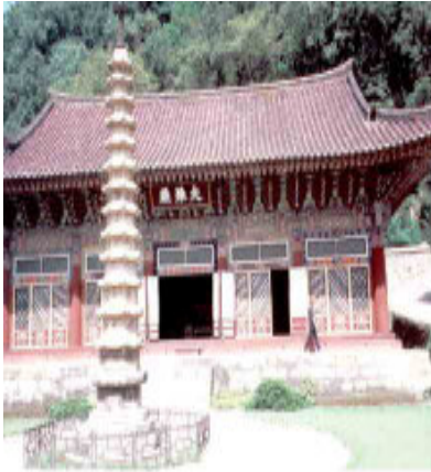
Pohyon Buddhist Temple, a North Korean ‘cultural relic’

Article 3 of the DPRK Constitution sets out the guiding role for Juche as an official system of thought or belief, just as Article 11 of the Constitution confers a “leading role” on the Korean Workers Party (KWP). Kim Jong Il, largely as prelude and/or precursor to his succession, merged the Juche ideology with the ideology of Kim Il Sung known officially as Kimilsung Hyukmyeong Sasang (Kim Il Sung Revolutionary Thought) or Kimilsungism. This merged ideology is presented by the state as a “monolithic” or “unitary” ideological system; it is referred to in Korean as “ Yuil (only one) Sasang (ideology) Chegye (system).” 36 It is understood by the former North Koreans interviewed for this report as being the only thought and belief system allowed in North Korea, to the exclusion of all others, as well as the highly elaborate basis for the cult of personality, pre-1945 Japanese-style “emperor worship,” or semi-deification that surrounds the memory of North Korea’s Great Leader, Kim Il Sung. 37