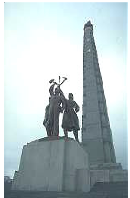
Juche Statue towers over Pyongyang

In the words of one North Korea scholar, Juche became “not an ordinary political ideology but a complex system of values utilized for the purpose of political mobilization and regime legitimacy ... [T]he way people are inculcated into that system is similar to... a religious community.” 148 In the words of another Korea specialist, “ Juche was transformed from a nationalistic ruling ideology to a cult ideology making a break between political persuasion and religion.” 149 The rites and rituals by which ordinary Koreans are inculcated into the cult of