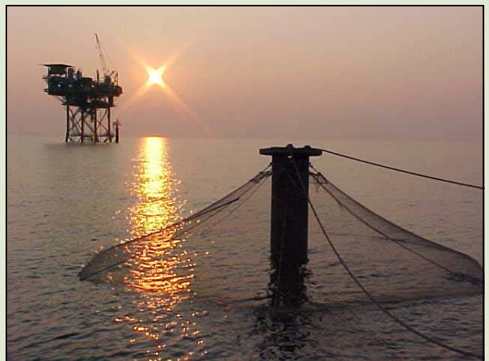
A net pen sits aside an oil rig, demonstrating just a couple uses of our offshore waters.