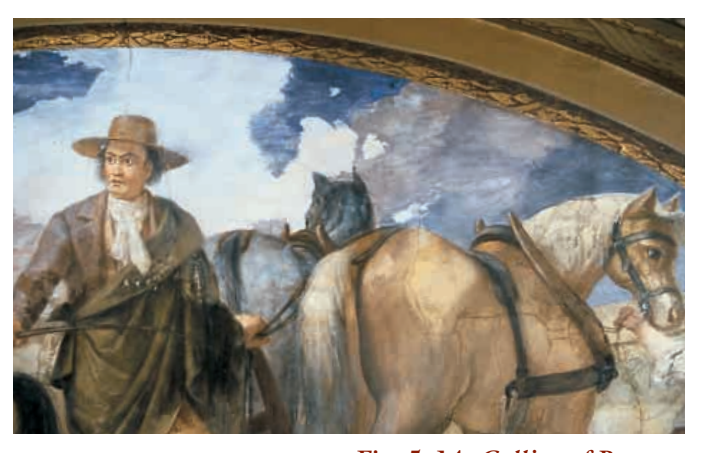
Fig. 5-14. Calling of Putnam during conservation. Disfiguring grime and overpaint have been partially removed. H-144.