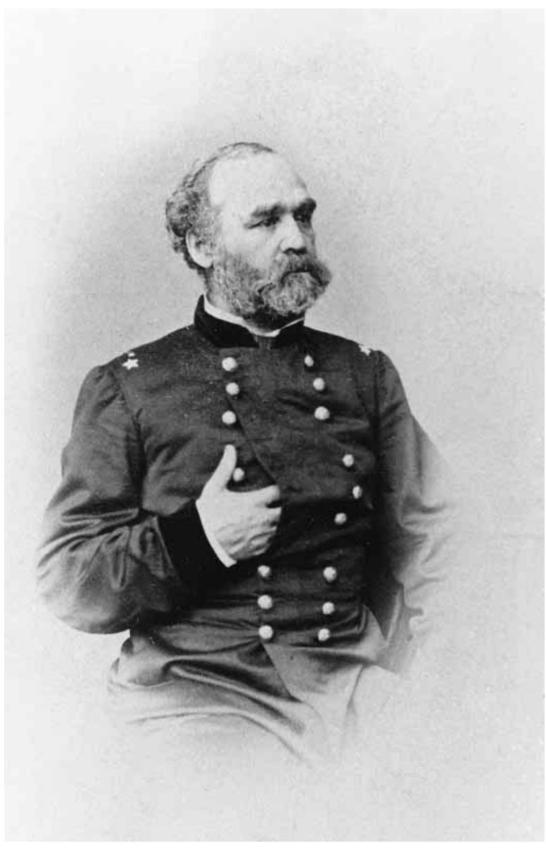
Fig. 5–6. Montgomery C. Meigs, c. 1861. In his role as supervising engineer, Meigs oversaw the art program carried out by Brumidi. Lola Germon Brumidi Family Album, United States Senate Collection.

within a few years established himself as the artist of the most important ecclesiastical and political monuments then being constructed.