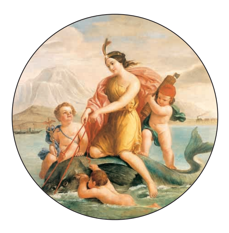
Fig. 5-4. Progress. Painted for a private home, Progress rides on a dolphin and wears a headdress with feathers and a star, suggestive of America. The cherubs hold symbols of commerce and liberty, while the steam ship Baltic and a locomotive appear in the distance, all motifs Brumidi later painted in the Capitol. Architect of the Capitol, donated through the United States Capitol Historical Society by Howard and Sara Pratt.

Five paintings by Brumidi were exhibited at the Mexican academy in January 1855, among them a portrait and