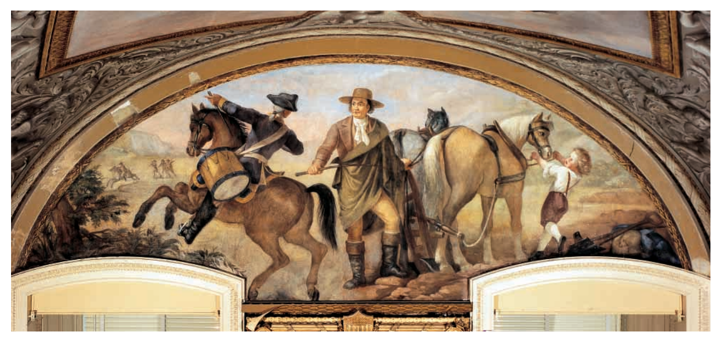
Fig. 5-12. Calling of Putnam from the Plow to the Revolution. Brumidi painted the American Revolution hero across the room from Cincinnatus, with horses instead of oxen, and with a drummer mounted on a rearing horse pointing him toward the battle in the distance. H-144.