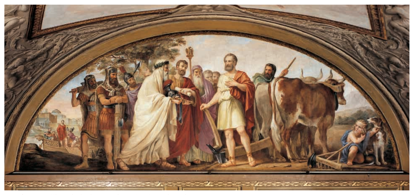
Fig. 5–11. Calling of Cincinnatus from the Plow. The fifth-century B.C. Roman hero at the center of the east lunette, standing by his oxen-drawn plow, receives a helmet and sword from a white-robed priest. H–144.