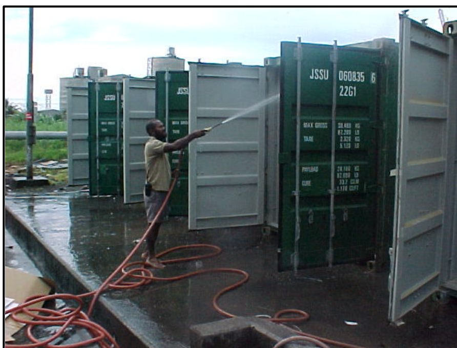
Container washdown in Papua New Guinea.