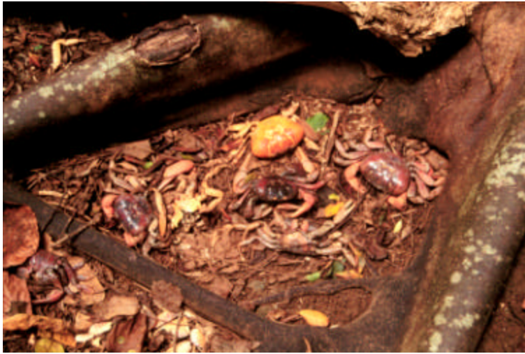
Red land crabs ( Gecarcoidea natalis ) killed as result of Yellow Crazy ants ( Anoplolepis gracilipes ) infestation on Christmas Island.

dieback. On Christmas Island in the Indian Ocean, secondary invasions of giant African landsnails ( Achatina fulica ) and shade-intolerant woody plants can follow invasion by A. gracilipes , further degrading native forests.