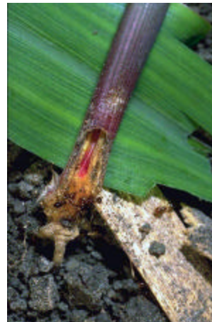
Fire ant damage to base of corn plant.

A recent study on the potential economic impacts of RIFA in Australia estimated conservatively that the cost of uncontrolled spread of Red Imported Fire Ants in that country would amount to AUD$8.9 billion in the first 30 years (Kompas & Che 2001).