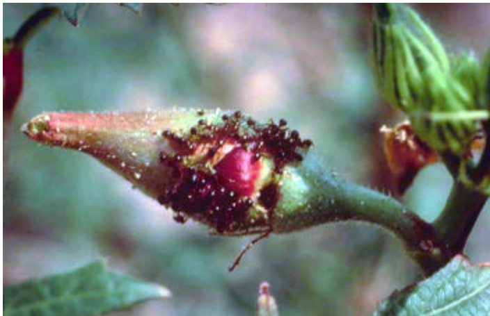
Fire ant feeding on okra bud.

A recent comprehensive economic analysis of impact costs in Texas, USA (population approximately 20 million) concluded that the total annual economic costs to that state alone exceeded US$1.2 billion (Lard et al. 2002). Approximately 60 percent of this cost was borne directly by residential households for control and repair costs. Almost US$150 million is spent annually on repair and replacement of electrical and communications equipment, and US$90 million on agricultural losses.