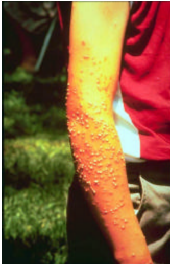
Pustules, blisters formed following fire ant sting on arm.

A survey of 1286 practitioners in South Carolina (USA) (population, four million), where fire ants are well established, estimated that annually over 33,000 people (94 per 10 000 population) seek medical consultation for RIFA stings, and, of these, 660 people (1.9 per 10,000 population) are treated for anaphylaxis (Caldwell et al. 1999). Direct extrapolation of these data to the Australian situation for example would suggest that about 140,000 consultations and 3,000 anaphylactic reactions are to be expected annually should Red Imported Fire Ants become established in that country.