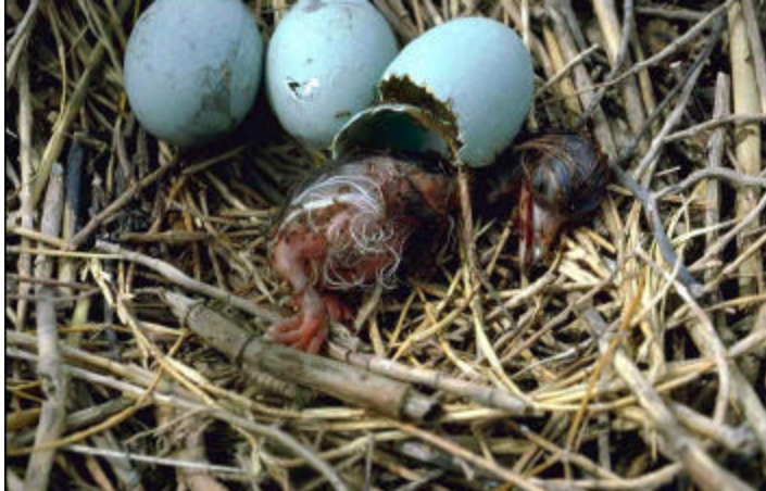
Tricolor heron chick being attacked by fire ant workers.

Severe impacts on native vertebrate species have also been observed in the USA. Affected species include small rodents (Holtcamp et al. 1997) deer (Allen et al. 1997a), ground nesting birds (Allen et al. 1995; Giuliano et al. 1996; Pedersen et al. 1996), alligators (Allen et al. 1997b), and even sea turtles (Allen et al. 2001). Island ecosystems are likely to be far more vulnerable to biological invasions than mainland USA so it is likely that similar or greater impacts will be seen on Pacific Islands (e.g. crazy ants on Christmas Island).