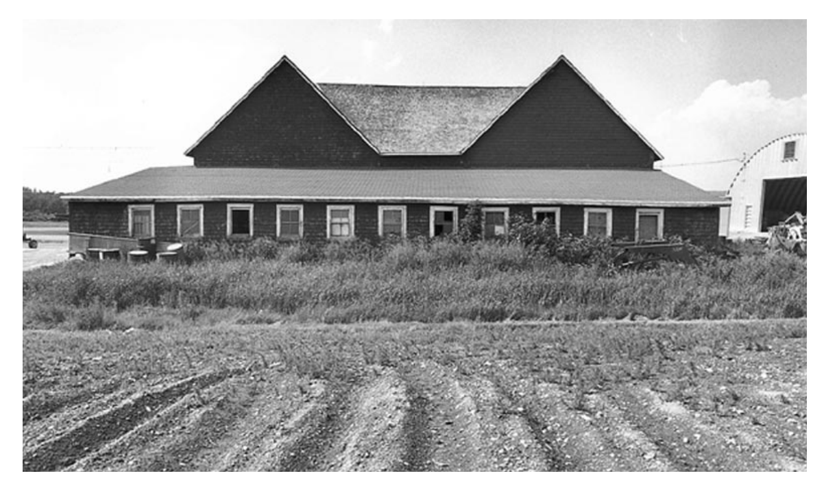
Figure 2: Twin barn near St. Agatha, Maine, 1991. (HM-B105, no. 21)