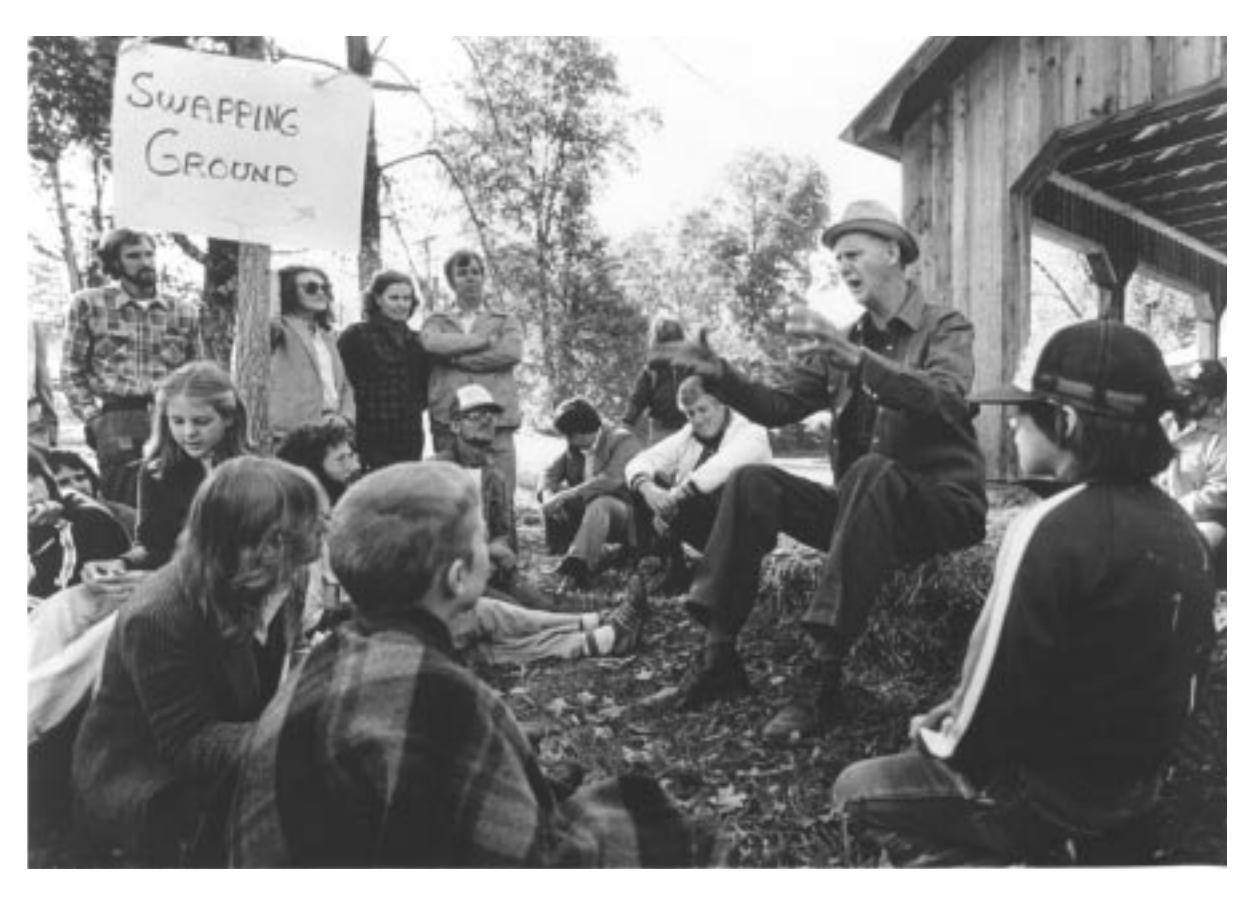
Ray Hicks tells a story at the National Storytelling Festival's "Swapping Ground," circa 1988.