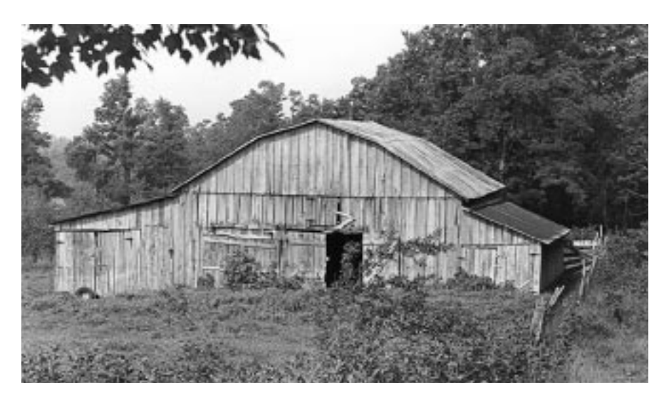
Figure 3: Barn near Woolwine, Patrick County, Virginia, 1978. (2–20205, no. 9)

larly dispatched teams of fieldworkers to various rural communities where they often docutraditional farming mented practices, I spent several weeks searching the collections of the Archive of Folk Culture. There I reviewed photographs made in south Georgia, the Blue Ridge mountains of Virginia and North Carolina, northern Maine, central Nevada, and several other western states. Examining the hundreds of contact sheets produced since 1977, I found numerous documentary images that were equally as compelling as those created by the FSA/ OWI pioneers. And especially pertinent for my project, here were images made by my fellow folklorists, who had deliberately focused on barn types as a key indicator of local identity. Further, it was immediately apparent that the high documentary standards for practice set by the FSA/OWI continued to live on in these AFC projects.