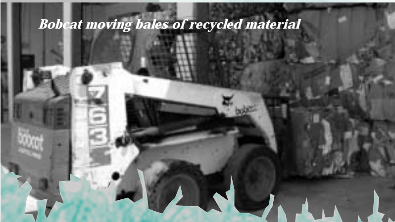
Bobcat moving bales of recycled material

...to lead by example, to be good stewards of the resources with which we have been entrusted, and to be good neighbors in our communities.