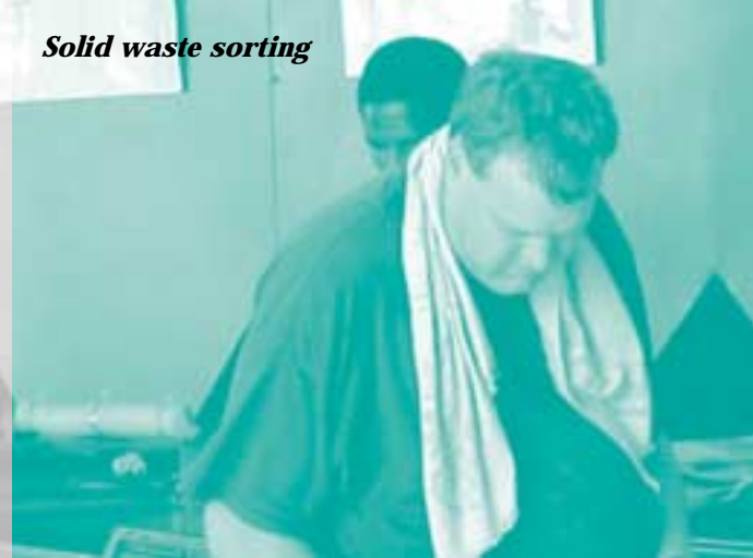
Solid waste sorting

...to lead by example, to be good stewards of the resources with which we have been entrusted, and to be good neighbors in our communities.