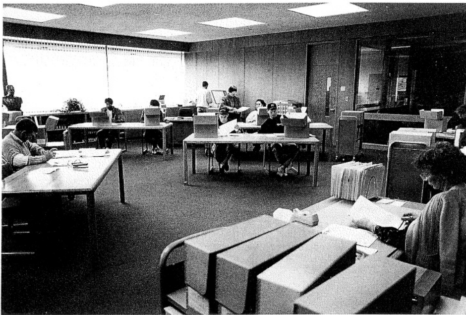
Scholars, students, and patrons examine documents in the library's research room.

specific files for his memoirs. A journalist examined files that helped him explain would-be assassin Lynette "Squeaky" Fromme as an icon for the failure of 1960s social protest.