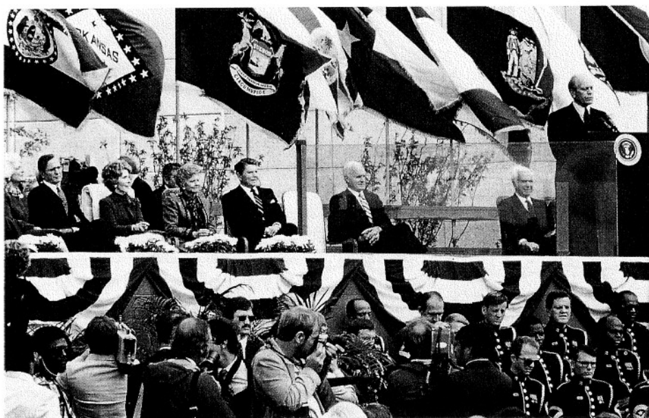
Former President Ford addresses guests at the dedication of the Gerald R. Ford Museum in Grand Rapids, MI, on September 17, 1981.

The Gerald R. Ford Library and Museum are separated by 130 miles but joined in a common program under one director. The library/archives is on the Ann Arbor campus of the University of Michigan, Ford's 1935 alma mater. The museum overlooks a city park on the Grand River in Grand Rapids, MI, where Ford grew to adulthood and won repeated election to Congress.