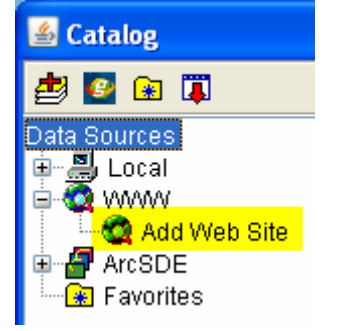
Figure 3: The Add Web Site option