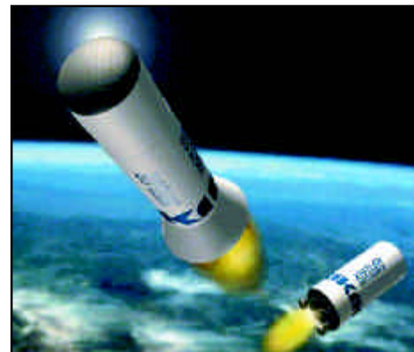
K-1 Reusable Launch Vehicle

Criteria for Determining "Unproven" vs. "Proven" RLVs: Develop criteria to assist in determining when an RLV progresses from an "unproven" to "proven" status.