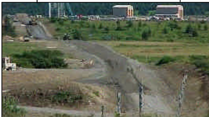
Kodiak Launch Complex

For additional information on FAA's office of the Associate Administrator for Commercial Space Transportation, go to: http://ast.faa.gov/ .