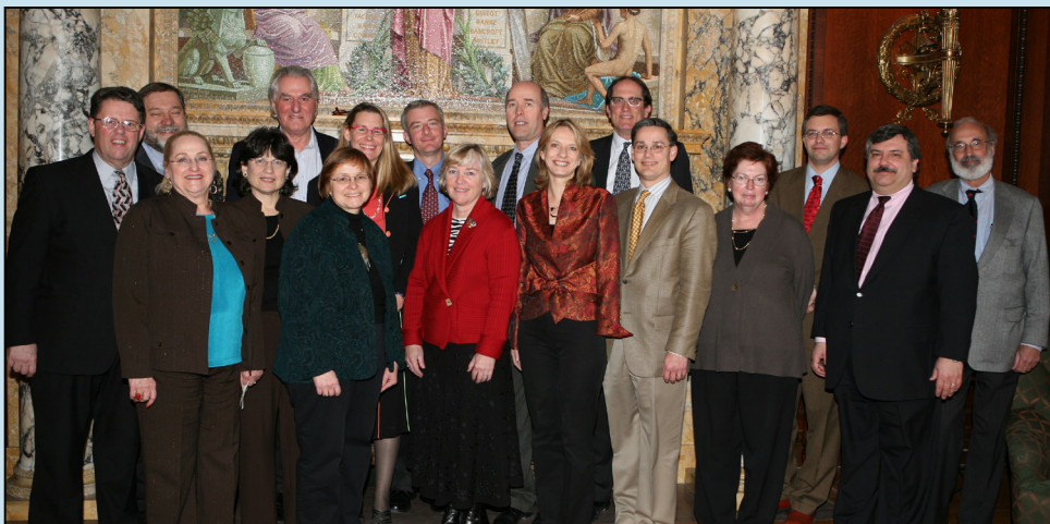
The Section 108 Study Group assembled in the Members Room at the Library of Congress.

For more information about the Study Group and to download a copy of its report, please visit www.section108.gov .