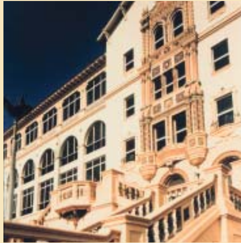
The Department of Veterans Affairs renovated its historic Bay Pines Medical Center, built in 1932 in St. Petersburg, FL, for use as an outpatient facility.