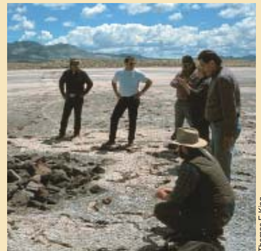
Navy staff consults with tribes on the effect of training range improvements on cultural sites at Naval Air Station, Fallon, NV.

Get well-qualified professional and technical advice about historic preservation to assist you and your agency.