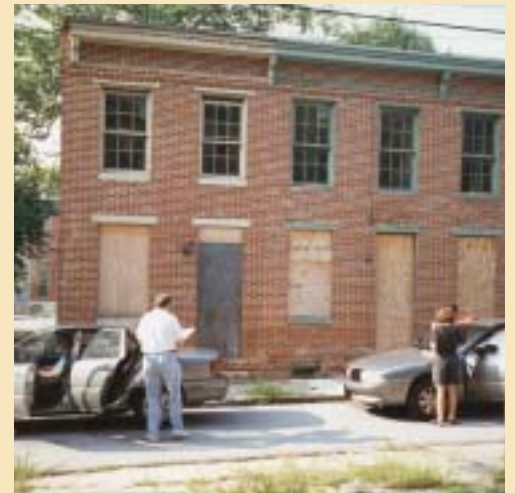
The Department of Housing and Urban Development provides financial assistance to non-profit sponsors through its 811 program to rehabilitate properties like these rowhouses in Union Square Historic District, West Baltimore, MD, for use as group homes for persons with disabilities.