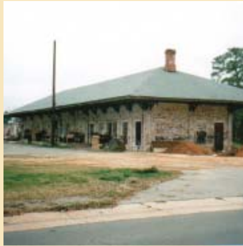
The Department of Transportation is providing TEA-21 transportation enhancement funds to help rehabilitate the Milledgeville, GA, railroad depot, originally constructed in 1854, for use by Georgia College and State University.

And finally, the challenge of taking advantage of opportunities for creative programs and projects that achieve both historic preservation and agency missions. For example, we need to look for opportunities for partnerships that preserve historic resources at little or no cost to the government.