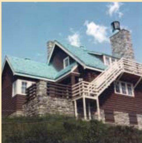
Chief Mountain Border Station (1938) in Babb, MT, is preserved by its continued use on the Canadian border by the Immigration and Naturalization Service and the U.S. Customs Service.

The National Park Service maintains a National Register of Historic Places that includes properties nominated through State, Federal or Tribal preservation officers. Federal agencies are responsible for thoughtfully managing resources both included in and also eligible for the National Register.