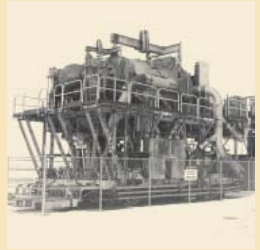
The Department of Energy's Experimental Breeder Reactor, a National Historic Landmark at the Idaho National Engineering and Experimental Laboratory in Scoville, ID, was the world's first nuclear reactor to produce usable amounts of electricity in 1951.

Preservation does not necessarily mean freezing places in time or restoring them as showpieces. Actually, the National Historic Preservation Act encourages active use of historic properties to meet the needs of the agency and of the public. Although maintaining historic properties in perpetuity is favored by the law, it's understood that this is not always feasible, so other forms of preservation—for example through study and documentation—are often acceptable. We decide how best to preserve historic places in consultation with concerned citizens, State and Tribal Historic Preservation Officers, local governments, tribes, Native Hawaiian organizations, Alaska Native groups, and others.