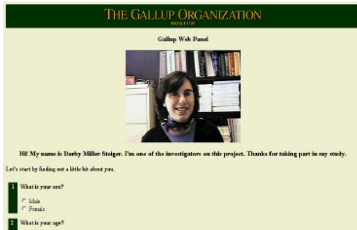
Figure 3: "Female" Interface