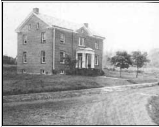
U.S. Navy Monitoring Station “S” – Bainbridge Island, 1940

was first scanned at the watch center in Washington. And, like the first message, it was put into the in-basket to be worked later.