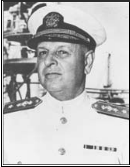
Admiral Husband Kimmel

the unexpected communications changes by Tokyo's navy on 1 and 3 December. In fact, he had testified that certain of these actions had not unduly alarmed him. 121 It might be asked of Kimmel that if the Japanese Navy's unusual communications activities had not prompted him to act, why then would he have alerted the Pacific Fleet solely on a vague notice to Tokyo's diplomats of relations in danger?