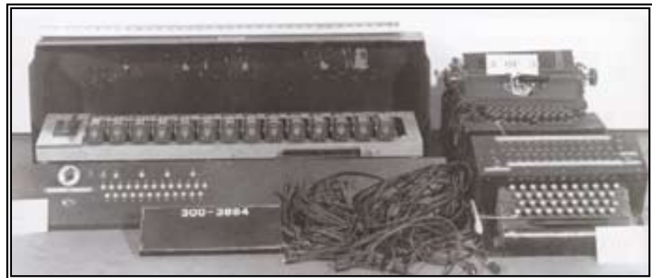
Purple analog device

The greatest achievement of the SIS, and the one most known to the public, occurred in September 1940. After eighteen months of sustained effort, the Japanese diplomatic cipher machine, the "B-machine," or what the Americans would call Purple, was solved. A team of cryptologists under Frank Rowlett, a former high school science and math teacher from Virginia who displayed a near virtuosity in solving Japanese ciphers and codes, worked at solving the device. Help from some navy codebreakers, some inspired cryptanalysis, and an engineering insight from other team members led to the machine's solution in September 1940. The team reconstructed an analog of the Japanese machine, a point often misunderstood by many writers on the subject. The Purple device was really an analog, that is, a machine that simulated the workings of the actual Japanese cipher device. In essence, then, the Americans had their own version of the Japanese machine.