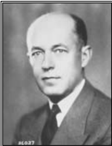
Herbert O. Yardley

During this interwar period, the United States actively worked against the encrypted messages of other countries, including Japan. The first organized attack was by the American Black Chamber formed and headed by a former U.S. State Department code clerk and War Department cryptanalyst, Herbert O. Yardley. The Black Chamber was an office jointly funded by the U.S. Departments of State and War.