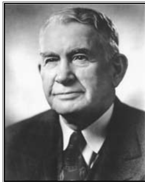
Senator Alben Barkley.

The background to this dispute was that on 28 August 1945 President Truman had issued a memorandum to seven cabinet and office secretaries and directors that ordered them to take such steps as necessary to prevent release of any information regarding "past or present status, technique or procedures, degree of success attained or any specific results of any cryptanalytic unit acting under the authority of the United States Government or any department thereof." 40 This was a blanket directive meant to protect all aspects of wartime cryptanalysis from compromise and not to hide Pearl Harbor records. Two months later, on 23 October, Truman issued another memorandum, which specifically exempted the congressional hearings from his earlier order and directed the State, War, and Navy Departments to make available all material to the committee, as well as authorize any employee or