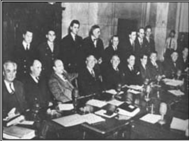
Joint Congressional Committee, November 1945 - May 1946

Foremost among the collections is the evidence contained in the Joint Congressional Committee Hearings on Pearl Harbor (1945-1946). The congressional hearings incorporated the evidence and testimony from the previous seven hearings and boards into its report. The Committee's Hearings included thirty-nine volumes of testimony and documentary evidence along with its Final Report.