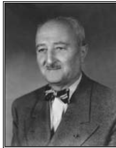
William F. Friedman