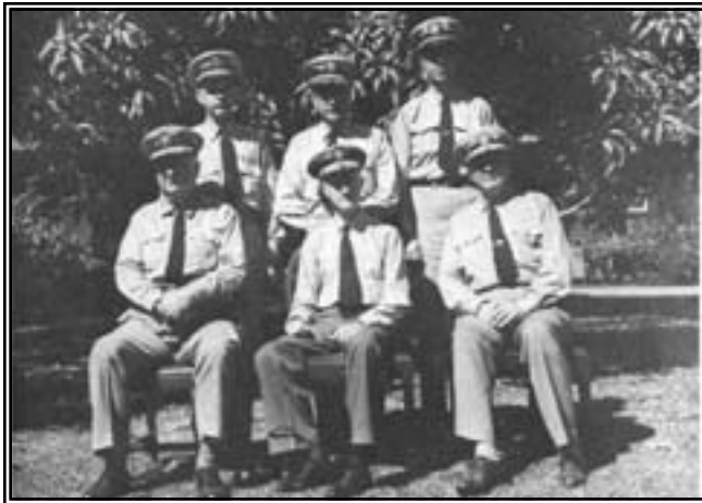
Pearl Harbor Naval Board of Inquiry, July – October 1944

all of the other investigations considered in detail testimony and evidence regarding the Winds message in the two weeks prior to 7 December. Two of the seven Pearl Harbor inquiries prior to the Joint Congressional Committee Hearings of 1945-1946, The Army Pearl Harbor Board (20 July – 19 October 1944) and the Navy Pearl Harbor Court of Inquiry (24 July - 20 October 1944), heard testimony that a “Winds Execute” (hereafter referred to as the “Execute message”) had been sent before 7 December. Both investigations concluded that the Execute message had been intercepted sometime on 4 December and that the substance of it indicated war between the United States and Japan and warned of the attack on Pearl Harbor. Both bodies also concluded that knowledge of the Execute message had reached the intelligence staffs of both the Navy and War Departments. 4