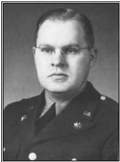
Frank B. Rowlett

Shortly after the Japanese introduced the new manual code in mid-summer 1940, an Army code-breaking team headed by Frank Rowlett managed to isolate it in the intercepted diplomatic traffic. Frank Byron Rowlett was one of the first persons hired in 1930 by William Friedman for the newly hatched Signals Intelligence Service. Rowlett was born in southwest Virginia in 1908. After graduating from college, he took a job as a high school math and science teacher. In 1930