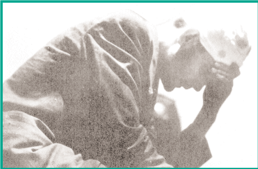
Ramon Mercader (Covername GNOME), after capture by Mexican police

The KGB communications between Mexico City and Moscow during 1943 to 1946 are a particularly rich historical trove, showing the elaborate plans to free from prison a man assigned the covername GNOME, who had murdered Trotsky in Mexico City in 1940. The murderer, who had been arrested at the scene of his crime, was known as Frank Jacson; he held Canadian documentation. Mexican authorities readily saw this documentation as a sham, but it would be many years before GNOME’s true identity was known, for he had many aliases. GNOME (GNOM in the Russian spelling) was in reality Ramon Mercader, a Spanish Communist recruited into KGB service by his mother, the Spanish Communist and KGB agent-officer Caridad Mercader. She appears in these VENONA messages as covername KLAVA.