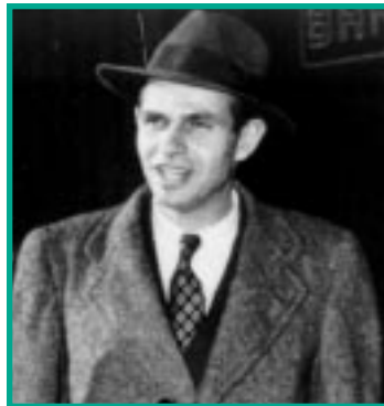
ALES Alger Hiss

Alger Hiss, a veteran GRU agent, is presumably found in one KGB message: Washington to Moscow, no. 1822, 30 March 1945. In this message, “A,” meaning the chief Illegal ALBERT (Iskak Akhmerov) reports about his interview of ALES, who describes his recent GRU career and says he has been a GRU agent “continuously since 1935.” Analysts later identified ALES as probably Hiss. Presumably, ALBERT was examining the possibility of transferring Hiss from GRU to the KGB.