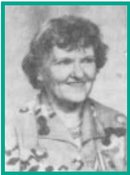
LESLIE Lona Cohen

The KGB successor organization has recently provided historians some information about Lona and Morris Cohen, their agents in the United States in the 1940s, and later infamous Illegals operating in the United Kingdom as Helen and Peter Kroger. Reportedly, Lona Cohen had the covername LESLIE while she was involved in atomic bomb espionage courier duties for the KGB (see NY's no. 50, 11 January 1945, the only VENONA reference to this covername. This message suggests that LESLIE/LESLEY had not been active for the previous six months).