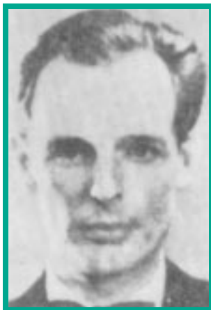
HOMER Donald Maclean