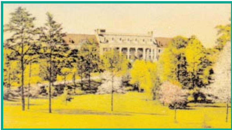
Arlington Hall before the war (This postcard was used by army recruiters.)

The accumulated VENONA message traffic comprised an unsorted collection of thousands of Soviet diplomatic telegrams