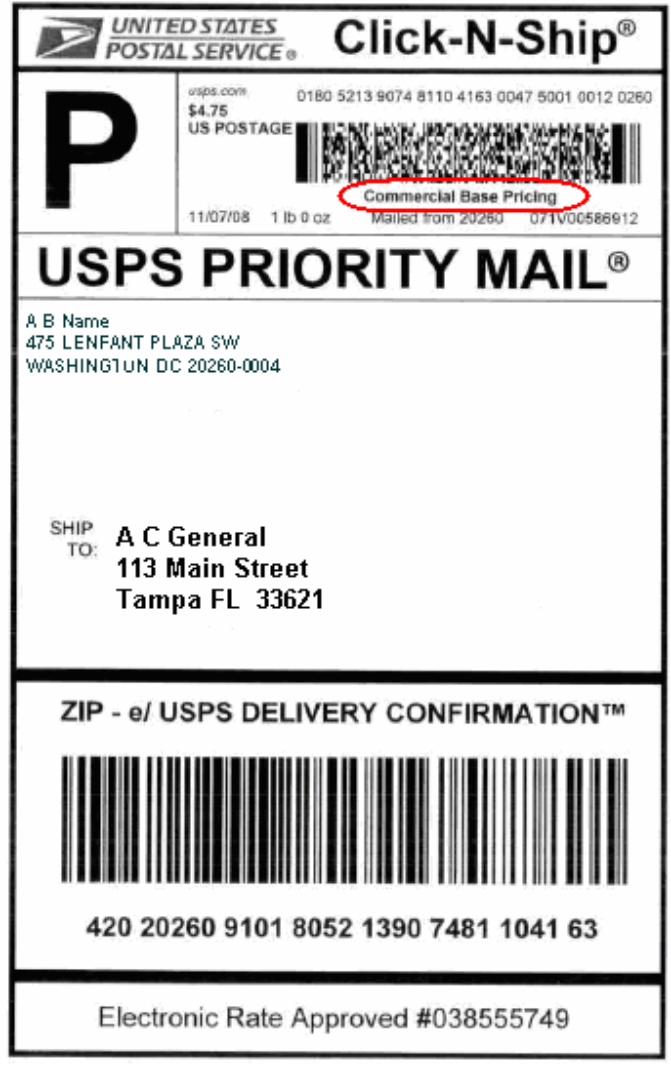
Example 1: Commercial Base Pricing in the Indicia Area

Data collectors should select option <1> if "Commercial Base Pricing" or its equivalent appears in the indicia area. During a transition period, option <1> should also be selected for mailpieces reflecting "ONLINE DISCOUNT". If none of these options appear in the indicia area, select option <0>.