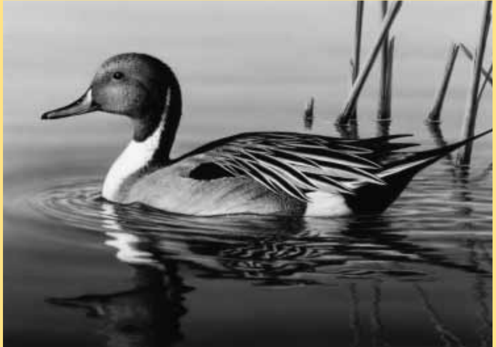
2000 Federal Duck Stamp Contest Winner

Please look at bolded areas on page 2 for important messages.