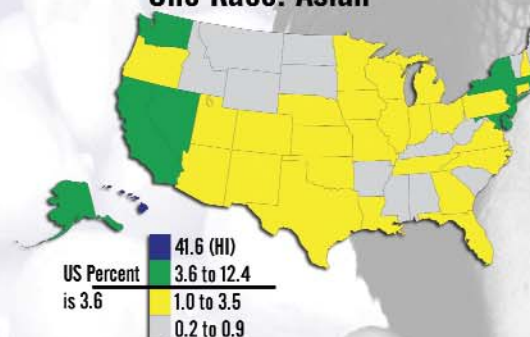
Percent of Population, 2000 One Race: Asian

According to the 2000 U.S. Census, Asian Americans represent 4.2% of the U.S. population or 11.9 million individuals.