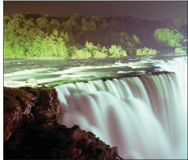
An international treaty preserves the beauty of Niagara Falls while making water available for hydropower production.

The initiative is the outgrowth of extensive discussions with Buffalo Niagara Enterprise, the marketing affiliate of the Buffalo Niagara Partnership, which represents 3,200 local employers, with a total work force of more than 200,000. In 2001, the partnership established a goal of increasing the availability of low-cost hydropower as one of nine initiatives critical to