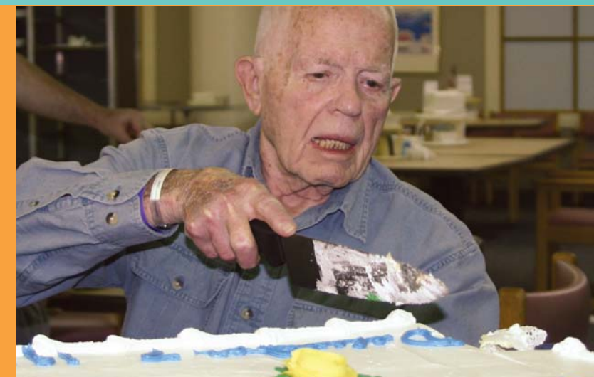
AFRH is home to several survivors of the 1941 surprise Japanese attack on America in Pearl Harbor, HI.