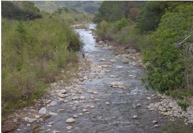
Fig. 23. Ventura River, riffle and pool habitat, below Foster Park Bridge, 5.75 mi above river's mouth, 3-23-03.