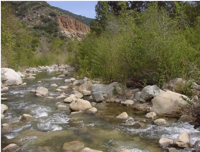
Fig. 7. Ventura River 1.5 mi above Robles Diversion, 3-23-03.