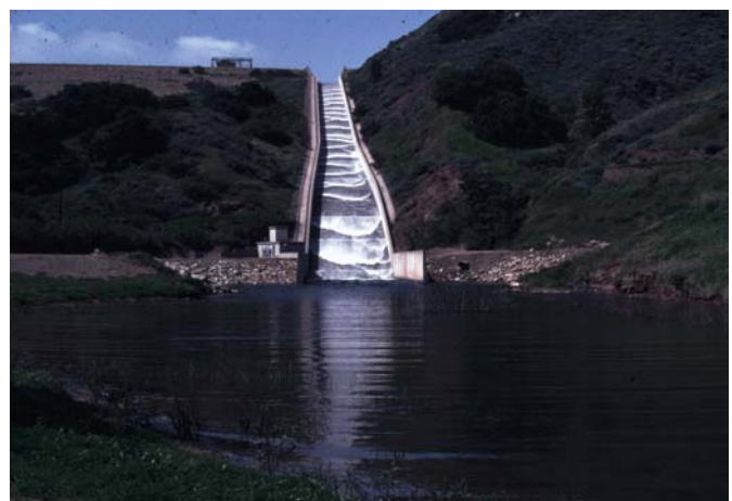
Fig. 20. Casitas Dam and Spillway, 2 mi above confluence of Coyote Creek and Ventura River, 6 mi above river's mouth, 4-29-78.