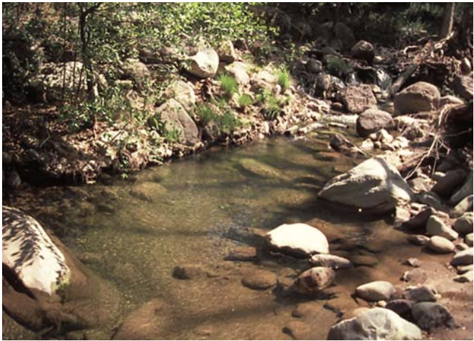
Fig. 17. Coyote Creek, cascade and pool habitat, 2.0 mi above Casitas Reservoir, 5-15-01.