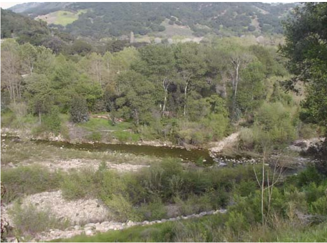
Fig. 15. Ventura River, Casitas Springs, 8.0 mile below the Robles Diversion, and 0.1 mi above the confluence of San Antonio Creek, 3-29-03.