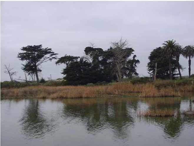
Fig. 27. Ventura River Estuary, 6-15-01.