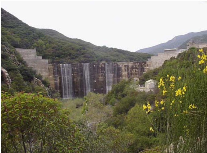
Fig. 3. Matilija Dam, 0.5 mi above confluence of Matilija Creek and North Fork Matilija Creek, 3-23-03.