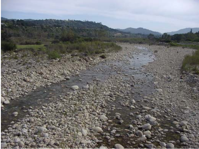
Fig. 13. Ventura River, critical riffle, downstream of Highway 150 bridge, 4.0 mi below Robles Diversion, 3-29-03.