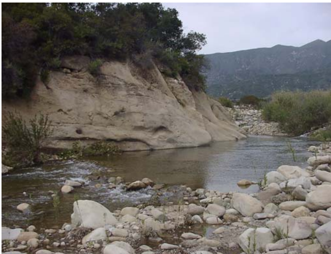
Fig. 11. Ventura River, pool habitat, 0.75 mi below Robles Diversion, 3-29-03.