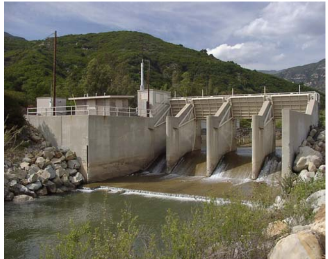
Fig. 8. Robles Diversion, 14.0 mi above mouth of Ventura River, 3-23-03.