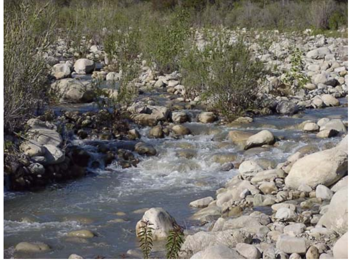
Fig. 10. Ventura River, cascade and run habitat, 0.5 mi below Robles Diversion, 3-19-03.