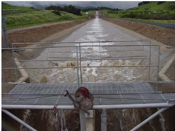
Fig. 19. Robles Diversion Canal at Highway 150, above Casitas Reservoir, 3-19-03.