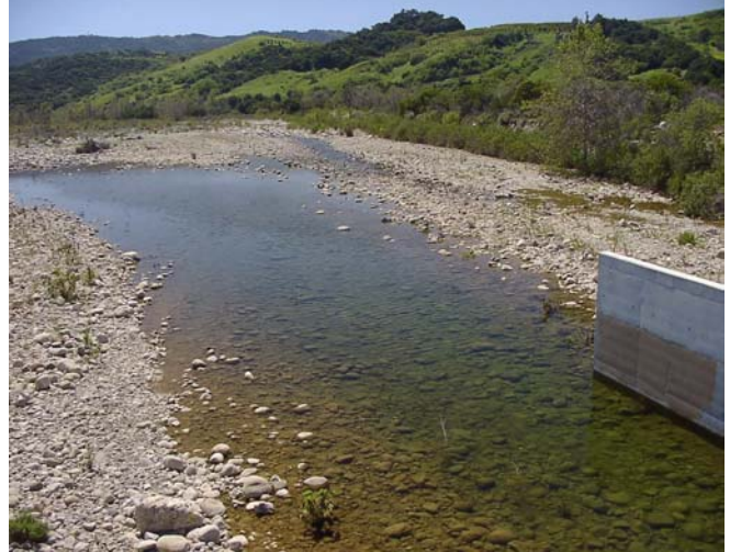
Fig. 14. Ventura River, critical riffle, downstream of Santa Ana Road Bridge, 5.0 mi below Robles Diversion, 3-29-03.