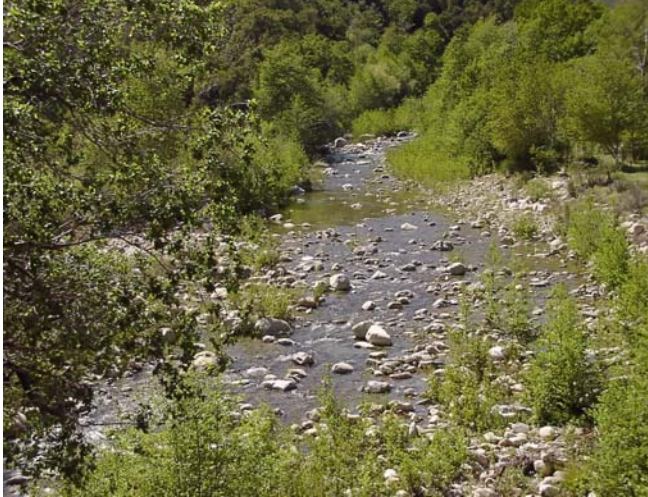
Fig. 1. Matilija Creek, riffle habitat, 2.0 mi above Matilija Dam, 3-29-03.