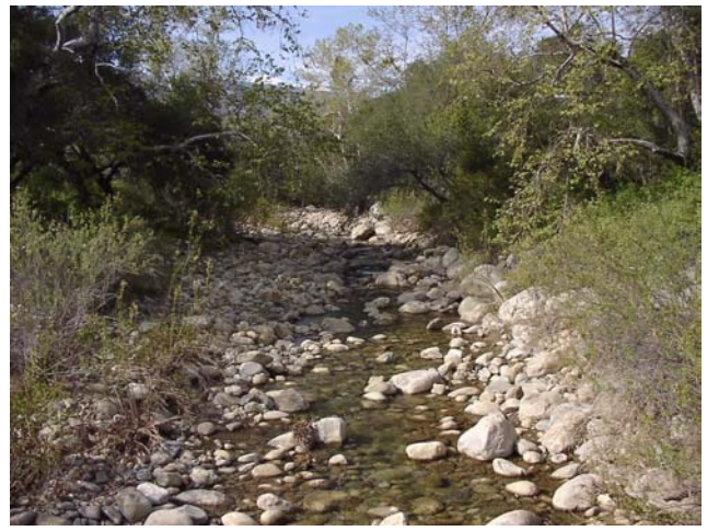
Fig. 18. Santa Ana Creek, riffle habitat, at Highway 150, above Casitas Reservoir, 3-23-03.