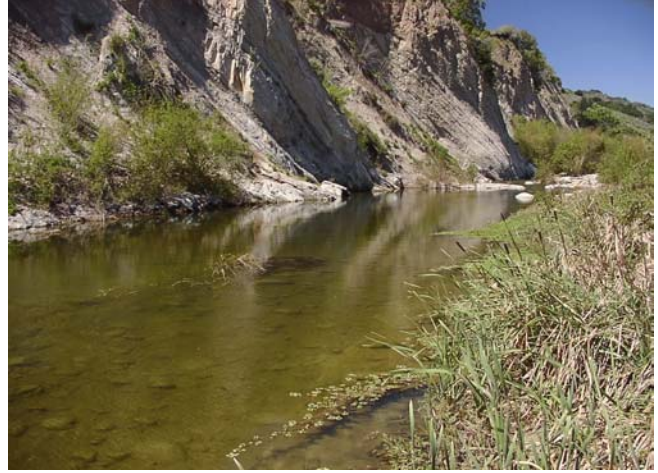
Fig. 26. Ventura River, pool habitat (Shell Hole), 4.25 mi above the river's mouth, 3-29-03.