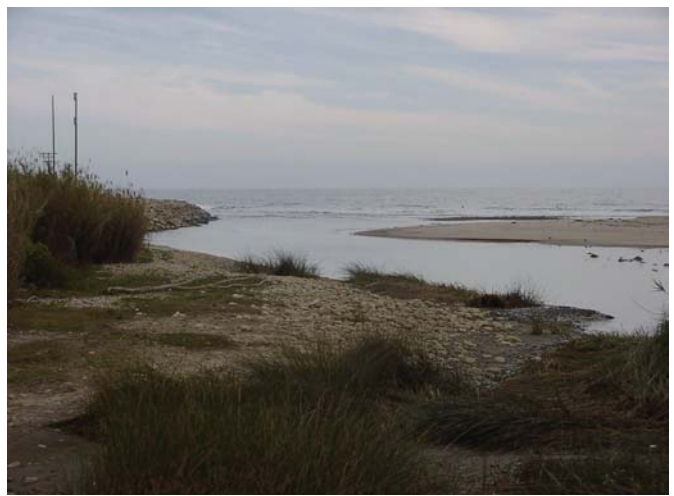
Fig. 28. Ventura River Mouth, 3-23-03.