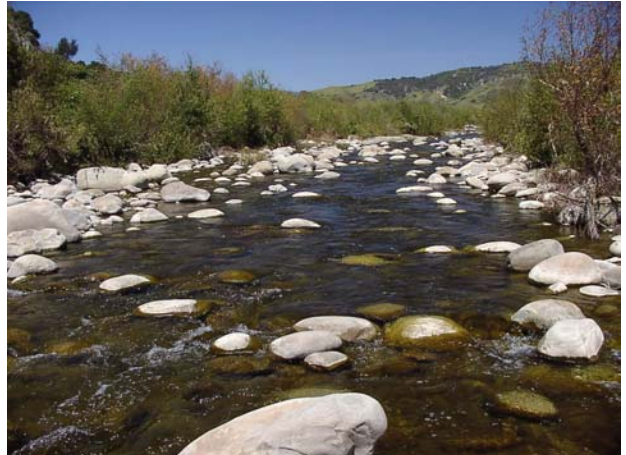
Fig. 24. Ventura River, riffle habitat, 4.5 mi above the river's mouth, 3-29-03.