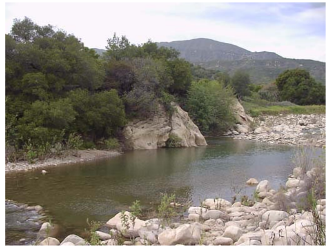
Fig. 12. Ventura River, pool habitat, 0.8 mi below Robles Diversion, 3-29-03.