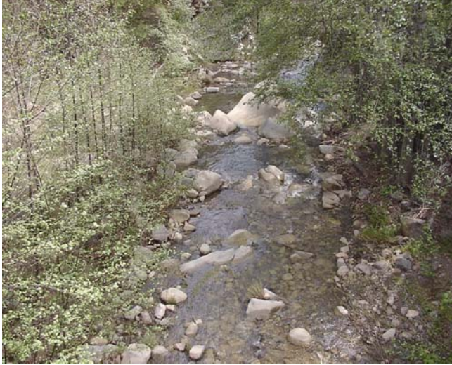
Fig. 5. North Fork Matilija Creek, riffle habitat, 2.0 mi above Robles Diversion, 3-29-03.