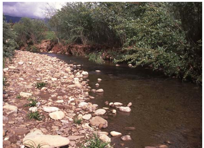
Fig. 16. San Antonio Creek, riffle habitat, Soule Golf Course, 7.0 mi above confluence of Ventura River, 4-15-01.