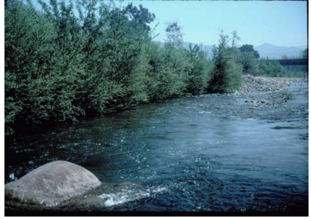
Fig. 22. Ventura River, riffle and pool habitat, 0.1 mi above Foster Park Bridge, 5.75 mi above river's mouth, 3-15-01.