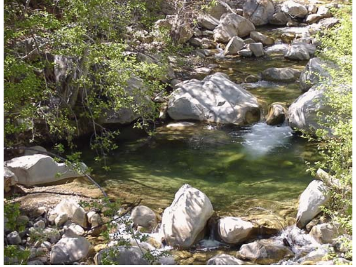
Fig. 6. North Fork Matilija Creek, pool habitat, 1.6 mi above Robles Diversion, 3-23-03.