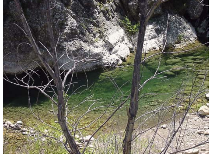
Fig. 2. Matilija Creek, pool habitat, 1.5 mi above Matilija Dam, 3-29-03.