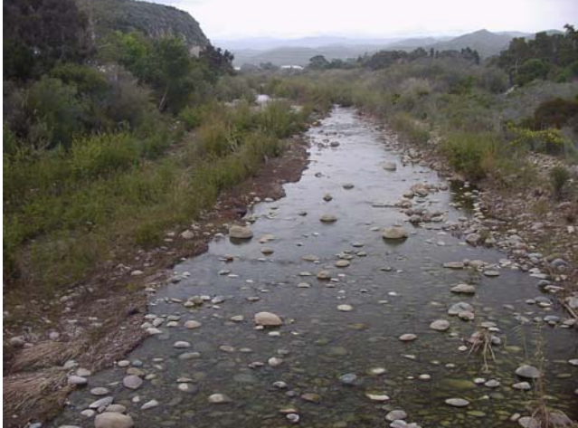
Fig. 25. Ventura River, riffle habitat, above Shell Road Bridge, 3.0 mi above river's mouth, 3-23-03.