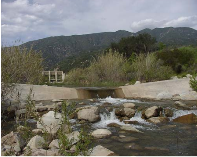
Fig. 9. Robles Diversion and downstream road-crossing/weir, 3-29-03.