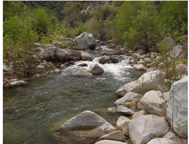
Fig. 4. Matilija Creek, cascade and run habitat, 0.5 mi below Matilija Dam, 3-23-03.