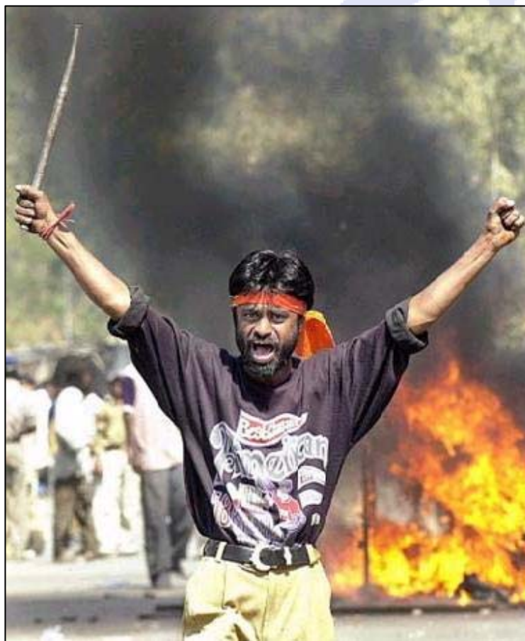
Hindu rioter in Gujarat, 2002