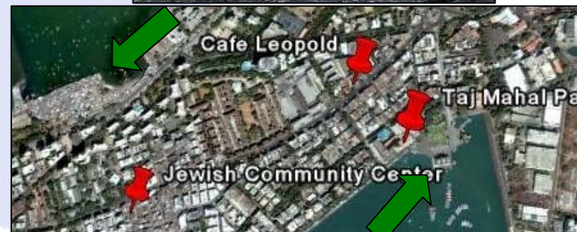
India Gateway (note Taj in background)