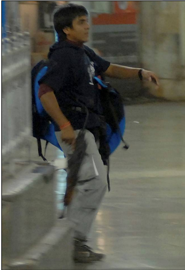
Image of attacker from CST