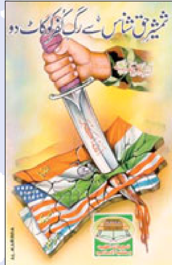
LeT recruiting poster